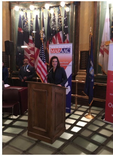
Governor Gretchen Whitmer