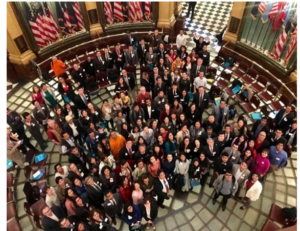
APAs in the Capitol rotunda