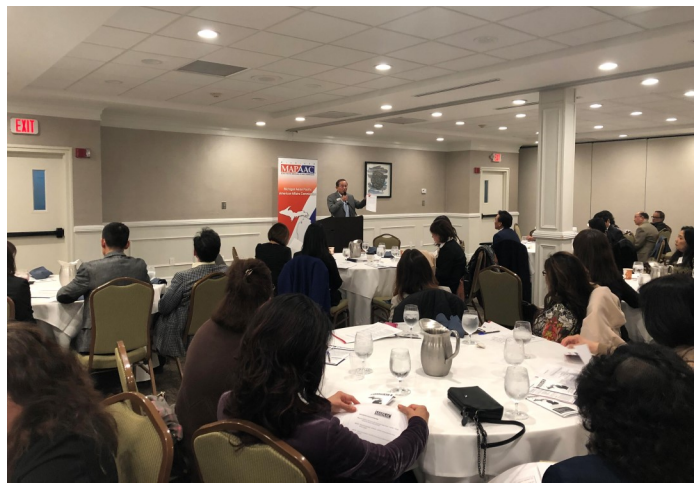
Forum attendees in Southfield, MI