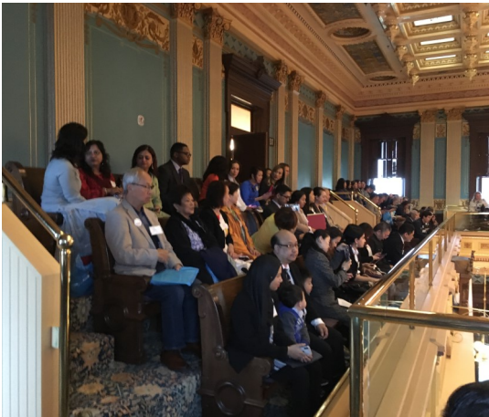
APA representatives at Senate Gallery