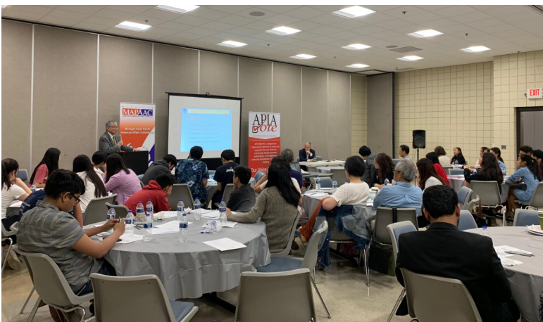
Participants of this Census Training Workshop