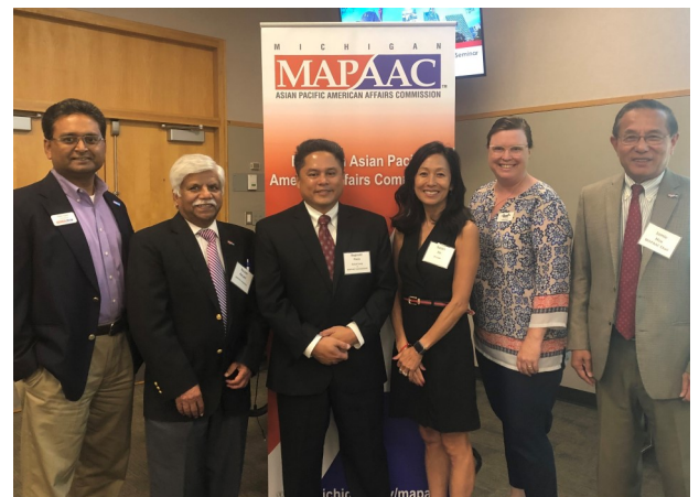
MAPAAC Commissioners with speakers