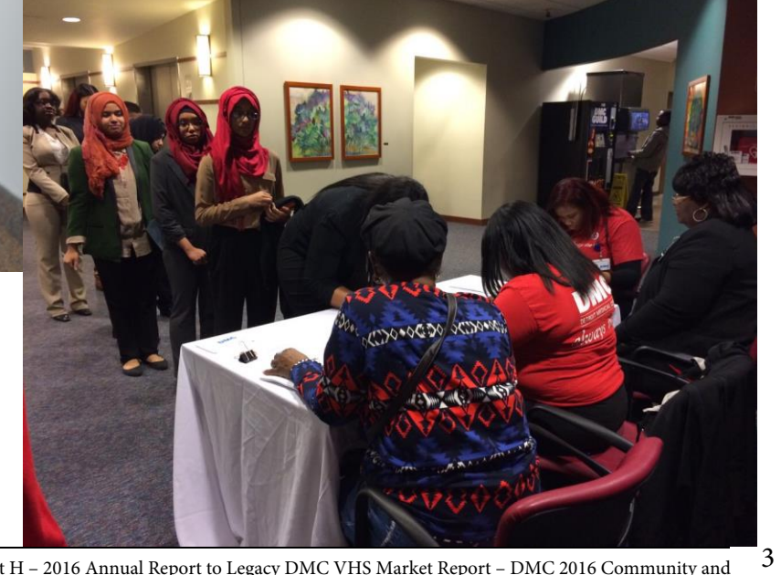
Exhibit H – 2016 Annual Report to Legacy DMC VHS Market Report – DMC 2016 Community and School Programs Annual Report