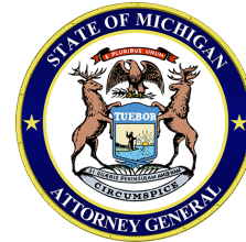
DANA NESSEL MICHIGAN ATTORNEY GENERAL