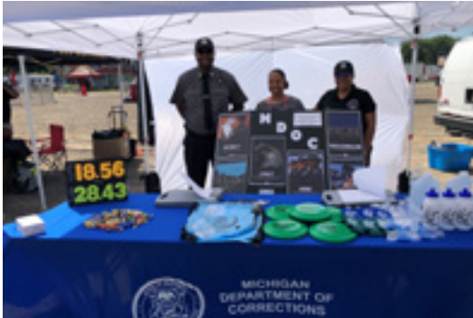
Members of the Women's Huron Valley Correctional Facility Recruitment Team spread the word about employment opportunities at WHV and the MDOC at the Saline Community Fair from Sept. 1 through Sept. 6.