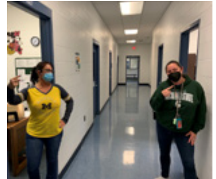
Charles E. Egeler Reception and Guidance Center staff showed team spirit for the Michigan vs. Michigan State football game.