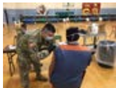
On January 28, Carson City Correctional Facility staff along with the help of the National Guard administered 223 COVID-19 vaccinations.