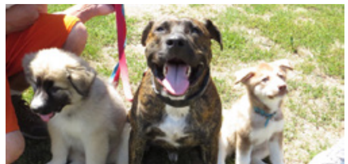
Committed to Protect, Dedicated to Success