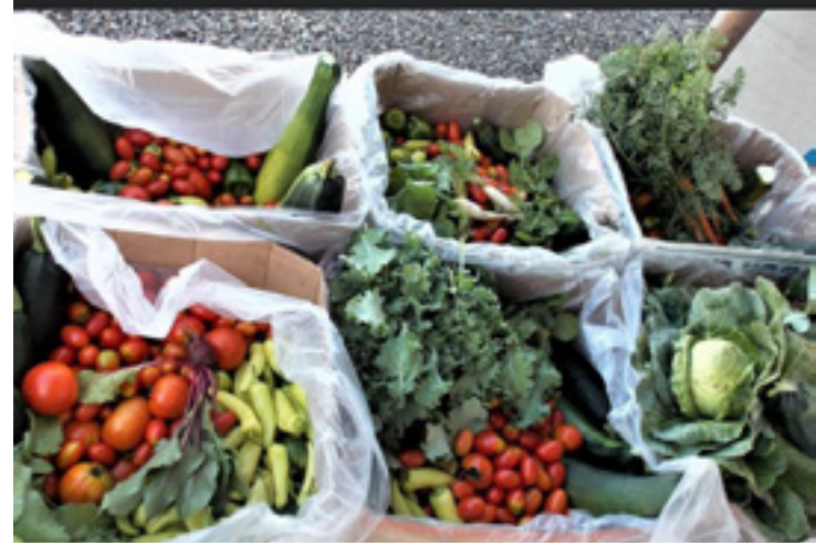
To see more, like the MDOC on Facebook