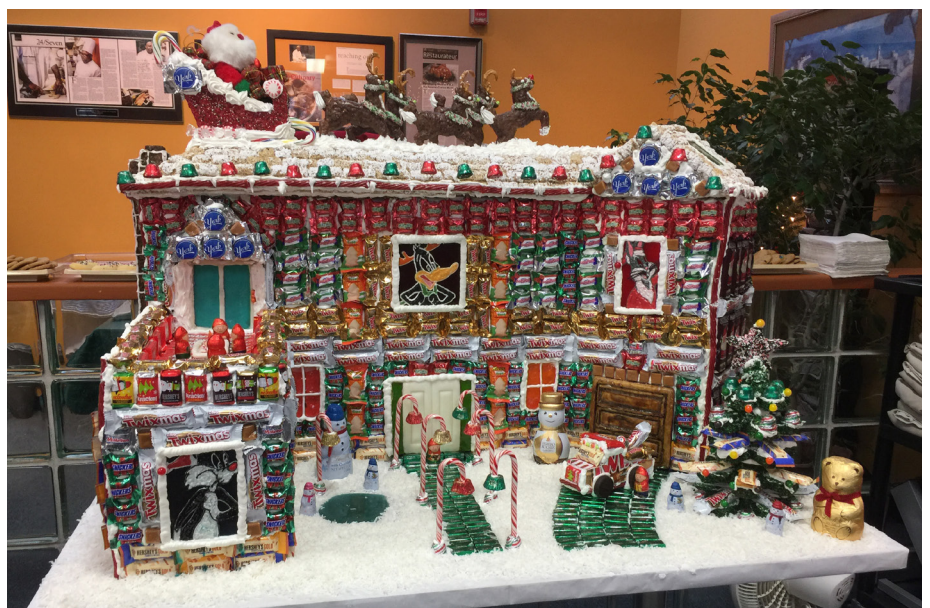
Pictured: The completed gingerbread house before being moved to Lakeland Correctional Facility's visiting room.