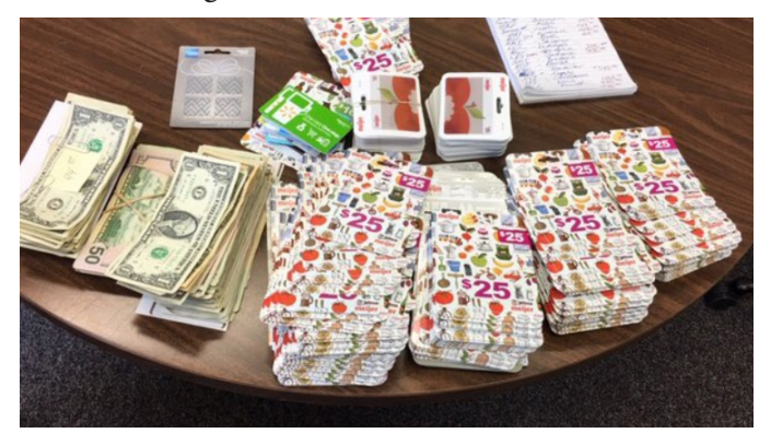
Committed to Protect, Dedicated to Success

"As a corrections officer at FCI Milan, I think I can speak for my fellow coworkers and say that we are beyond thankful," he wrote. "A lot of people and businesses offered help in many different ways, but this is amazing."