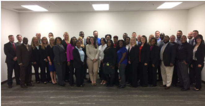
The MDOC welcomed a class of about 40 new parole and probation agents on September 20.