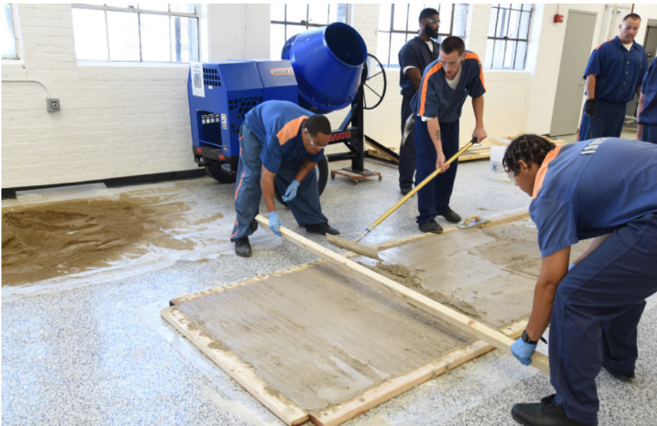
Prisoners in the concrete and masonry program practice the trade during the open house for the Parnall Vocational Village.