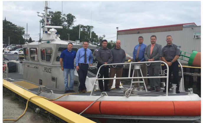
Kinross Correctional Facility staff visited the U.S. Coast Guard base in Sault Ste. Marie as part of a reciprocal leadership and training program between the agencies.