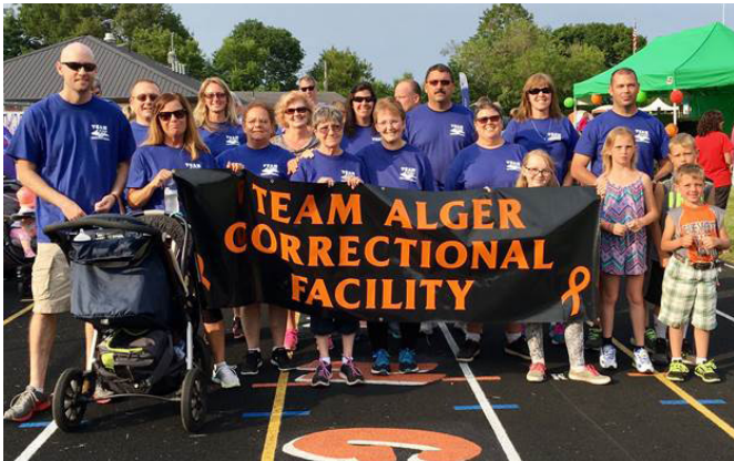
Employees from Alger Correctional Facility participated in the Relay for Life at Munising High School in July. The team raised $1,629.41.