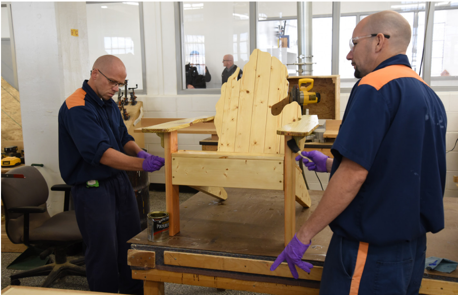
Building trades students at the Parnall Correctional Facility Vocational Village put the finishing touches on a handmade chair.