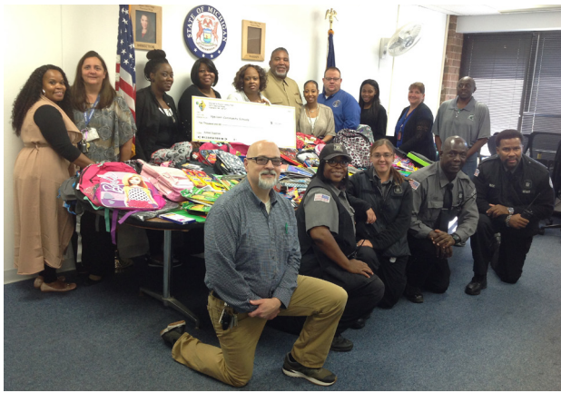
Pictured: Women's Huron Valley Correctional Facility staff with backpack donations (top left). Muskegon Correctional Facility staff with school supply donations (bottom left). Thumb Correctional Facility staff with school supply donations (bottom center). A child who received a T-shirt donated by Michigan State Industries (bottom right).

Michigan State Industries (MSI) also donated nearly 7,500 surplus T-shirts to Bethany Christian Services' Back-to-School Backpack event for children in foster care and refugee and immigration services programs. Bethany Christian Services staff were very excited and appreciative of the donation from MSI.