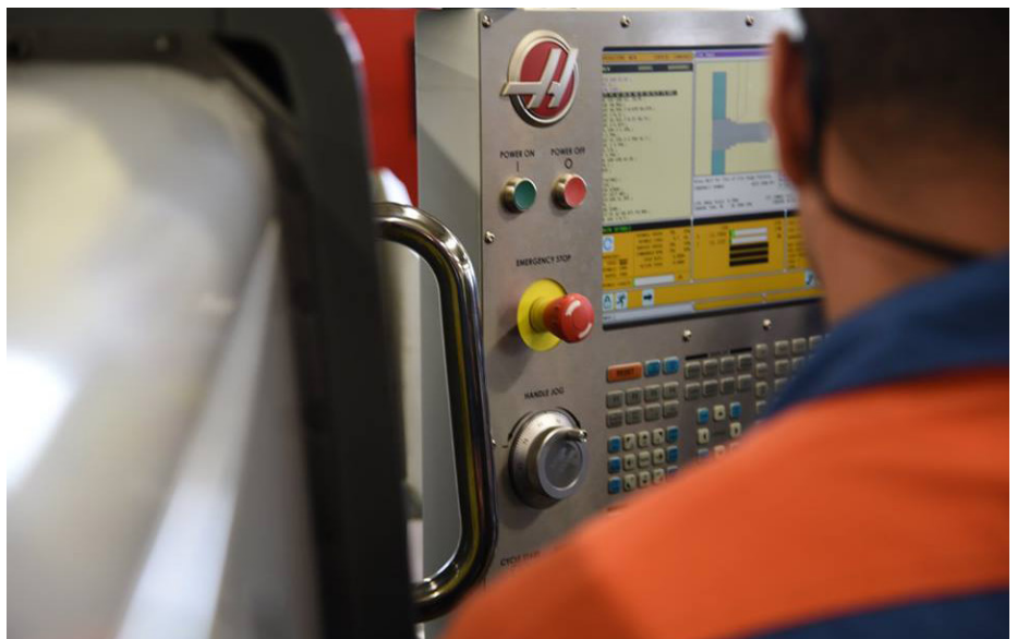
A Vocational Village student works on a Computer Numerical Controls machine.