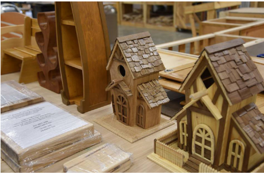
Examples of items made in the building trades program at the Vocational Village. Students also learn home construction and make cabinets for Habitat for Humanity.