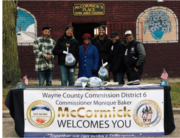
STIIIZY Social Impact Team with Commissioner McCormick

On November 14, 2022, STIIIZY’s Social Impact Team traveled to Detroit to take part in a turkey giveaway for veterans hosted by Wayne County Commissioner Monique McCormick. STIIIZY loaded cars with turkey and fixings to spread some Thanksgiving cheer ahead of the holiday.