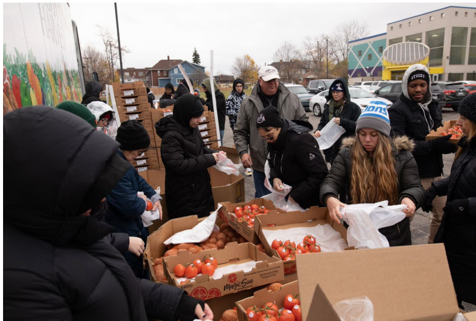
STIIIZY Volunteers and Forgotten Harvest Staff distributing produce

Then, on November 15, 2022 over 20 STIIIZY sales, retail, marketing, and social impact team volunteers joined forces with Metro-Detroit based Forgotten Harvest. Together STIIIZY and Forgotten Harvest served over 200 families at a pop-up pantry event. Goods distributed included fresh produce, pantry items, and desserts!