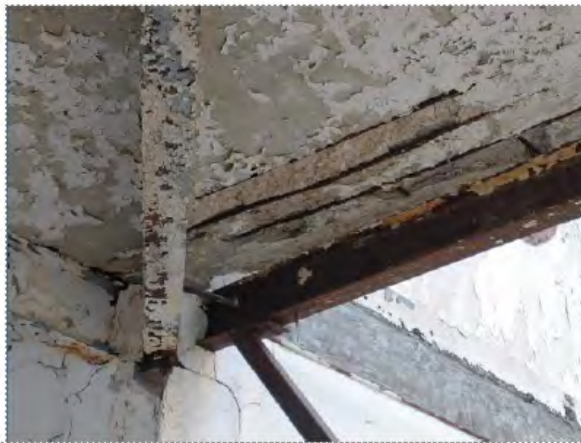
Photo No. 10 – Terrace roof slab with rusted rebar, spalled concrete.