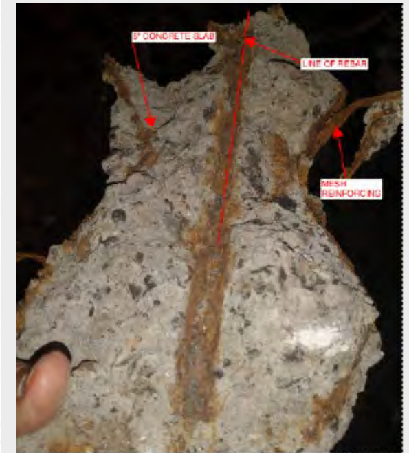
Concrete roof/floor structure exhibits deterioration throughout building