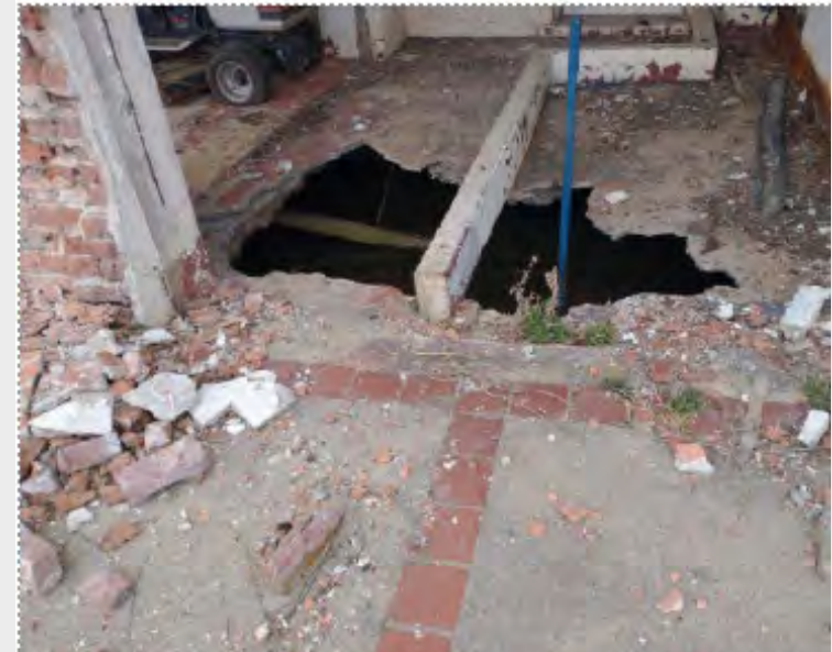
Photo No. 15 – Hole in first floor slab under the north terrace, east end.

Belle Isle Park Infrastructure Update, May 2022