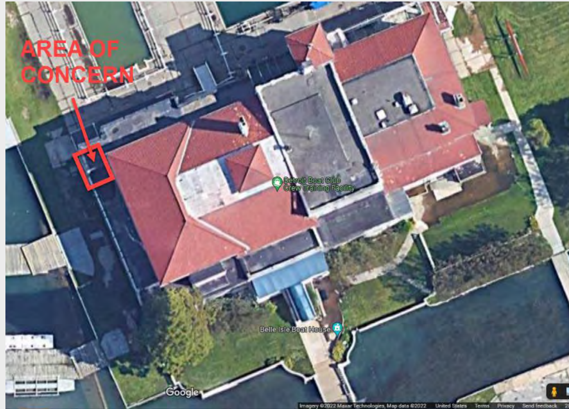
Boathouse Ceiling failure location

Belle Isle Park Infrastructure Update, May 2022