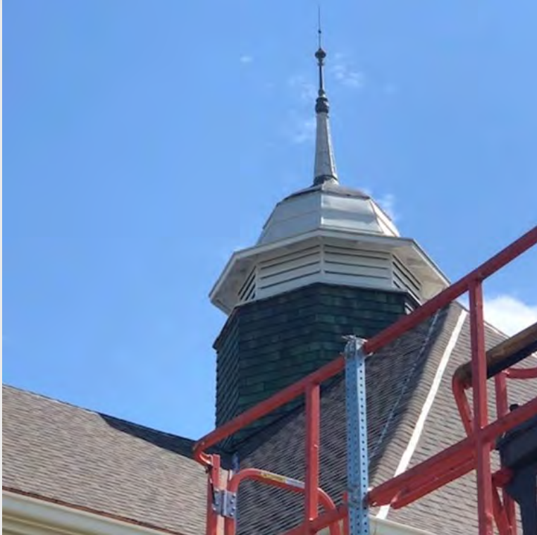
Two new finials installed on building cupolas, original finial on center cupola