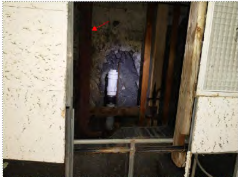
Photo No. 1 – Roof slab above Lounge 319. Rusted reinforcing and spalled concrete. Note newer red steel.