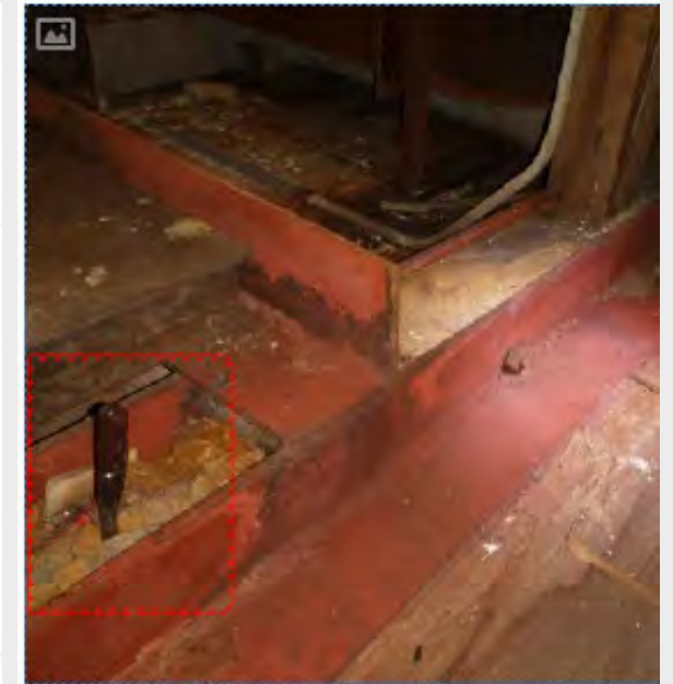
Photo No. 3 – Bottom chord wood truss over Conference reinforcement. Note knife in rotted wood.

Interior and exterior roof deterioration