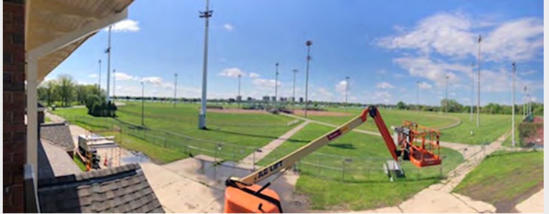
Veranda Railing is the final task for current Athletic Shelter Contract

Belle Isle Park Infrastructure Update, May 2022