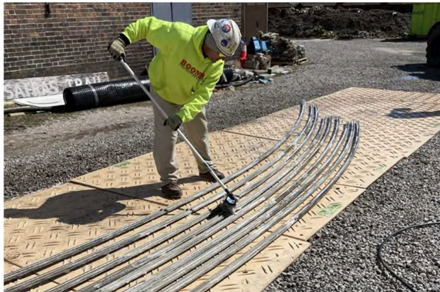
Aluminum glass framing being cleaned