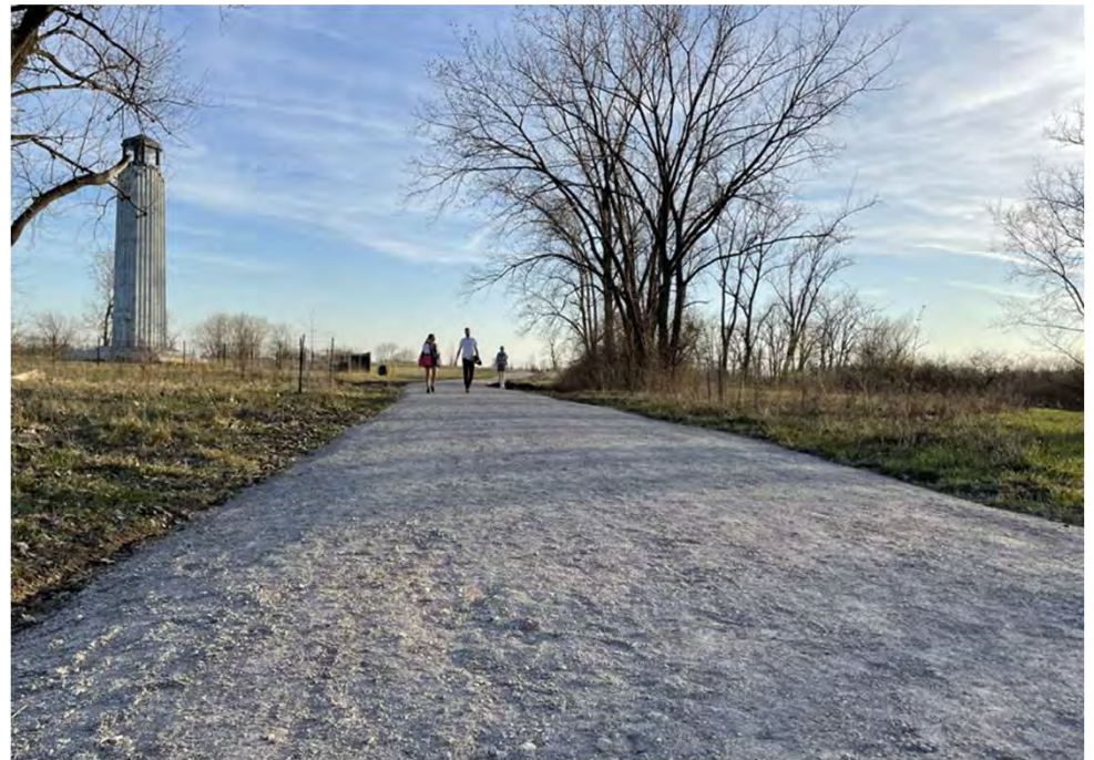
Trail Improvements complete