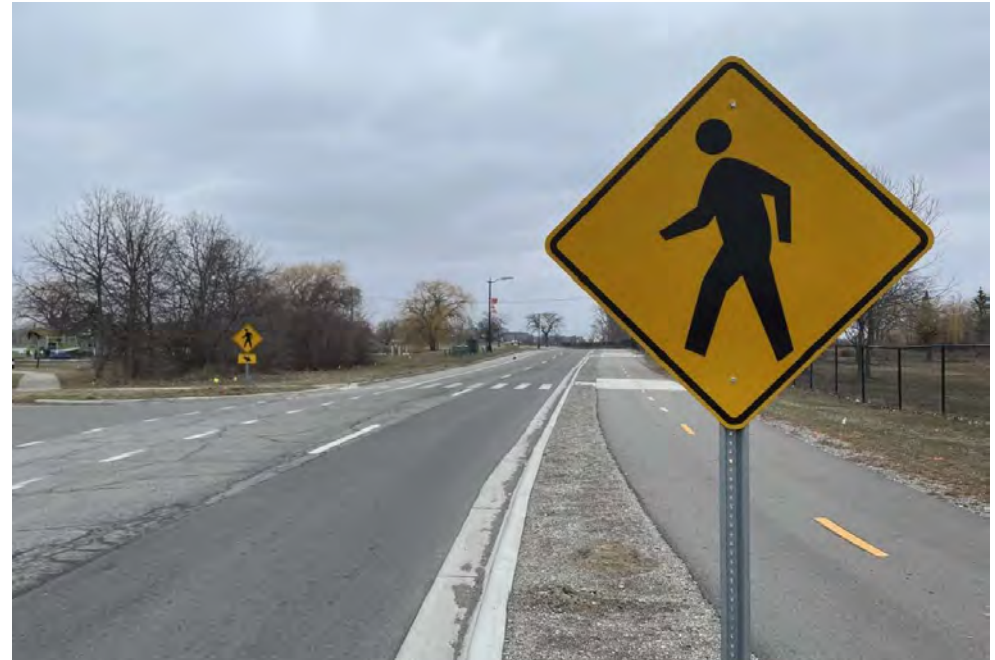
Walking/Biking one of the most popular park activities reported in multimodal mobility public survey