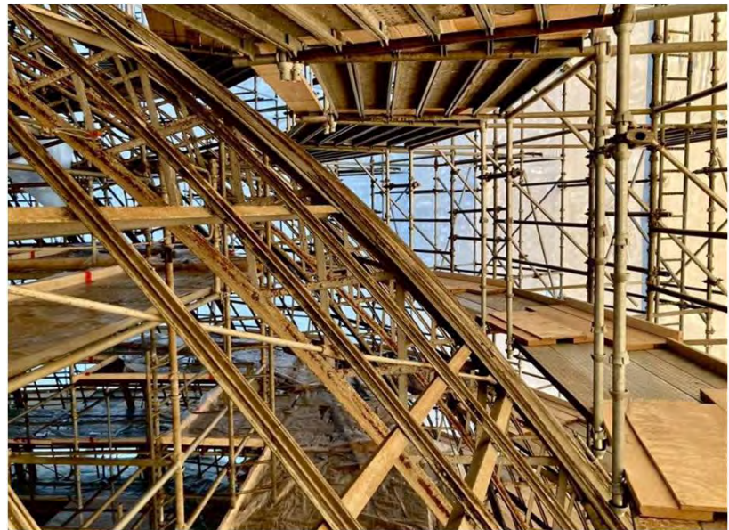
Glass removed, Steel ready for blasting