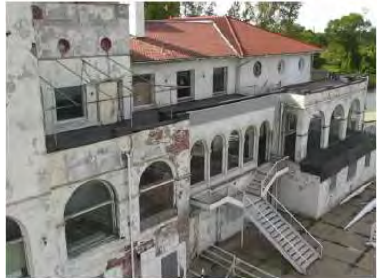
North side of the building compromised by water filtration over the years