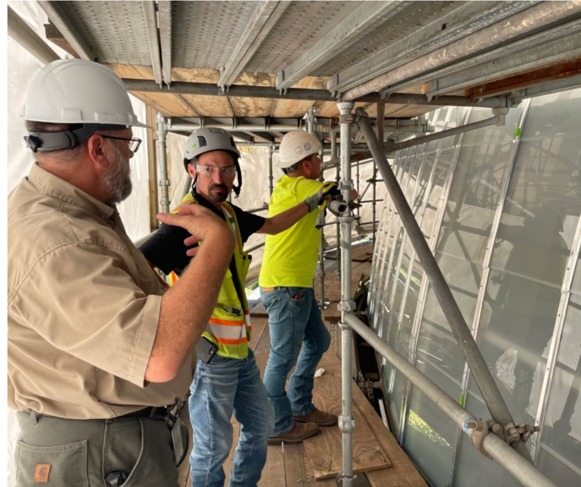
New glass installation in upper dome