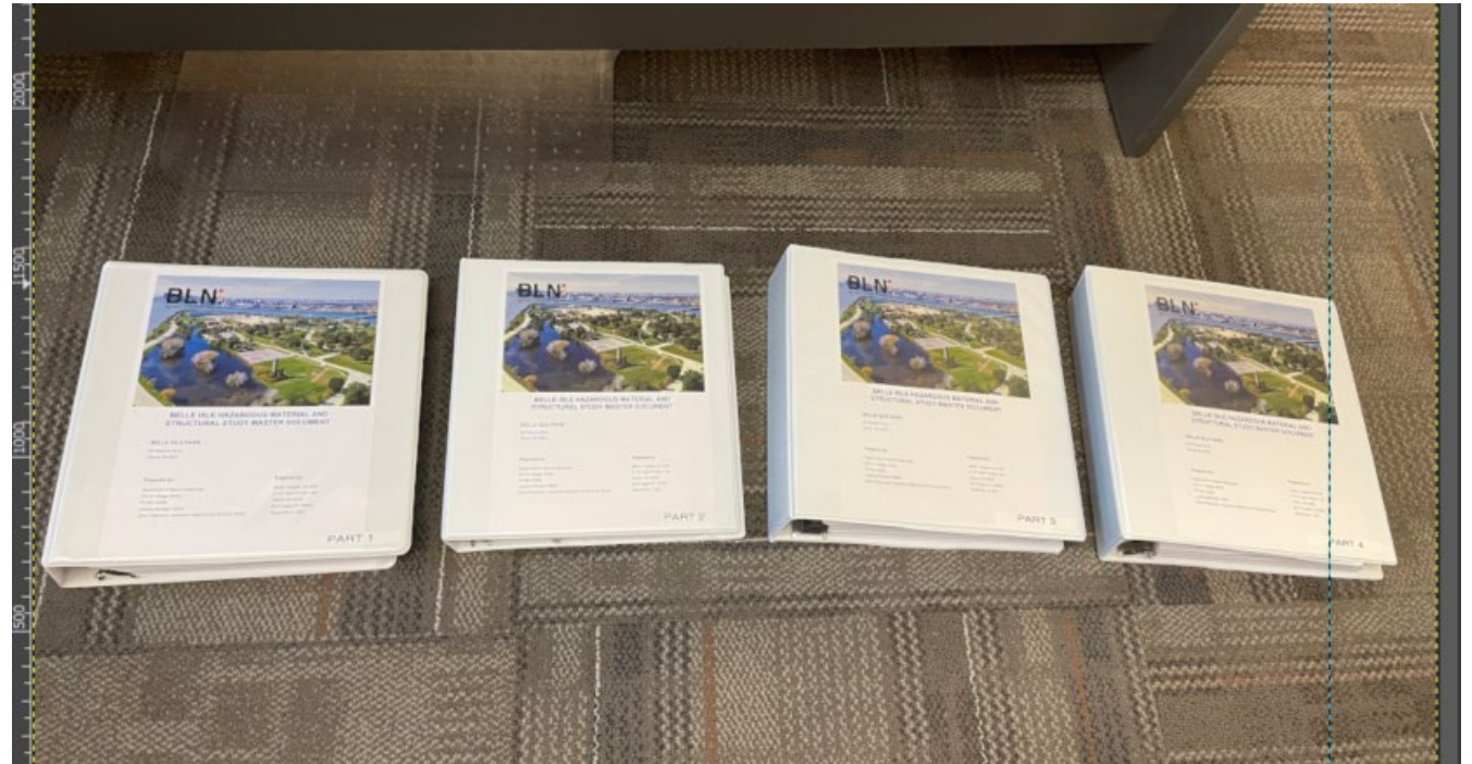
3,000 page draft Report for Haz. Mtls Testing records.