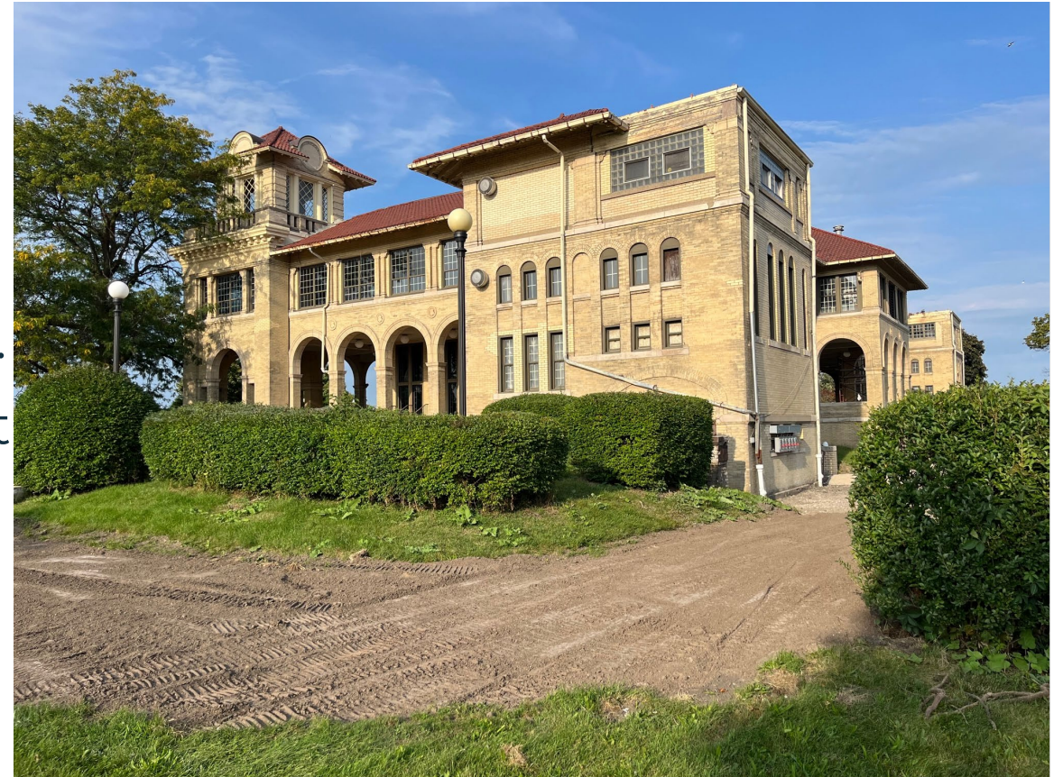
Belle Isle Casino – Contractor preparing for new HVAC equipment