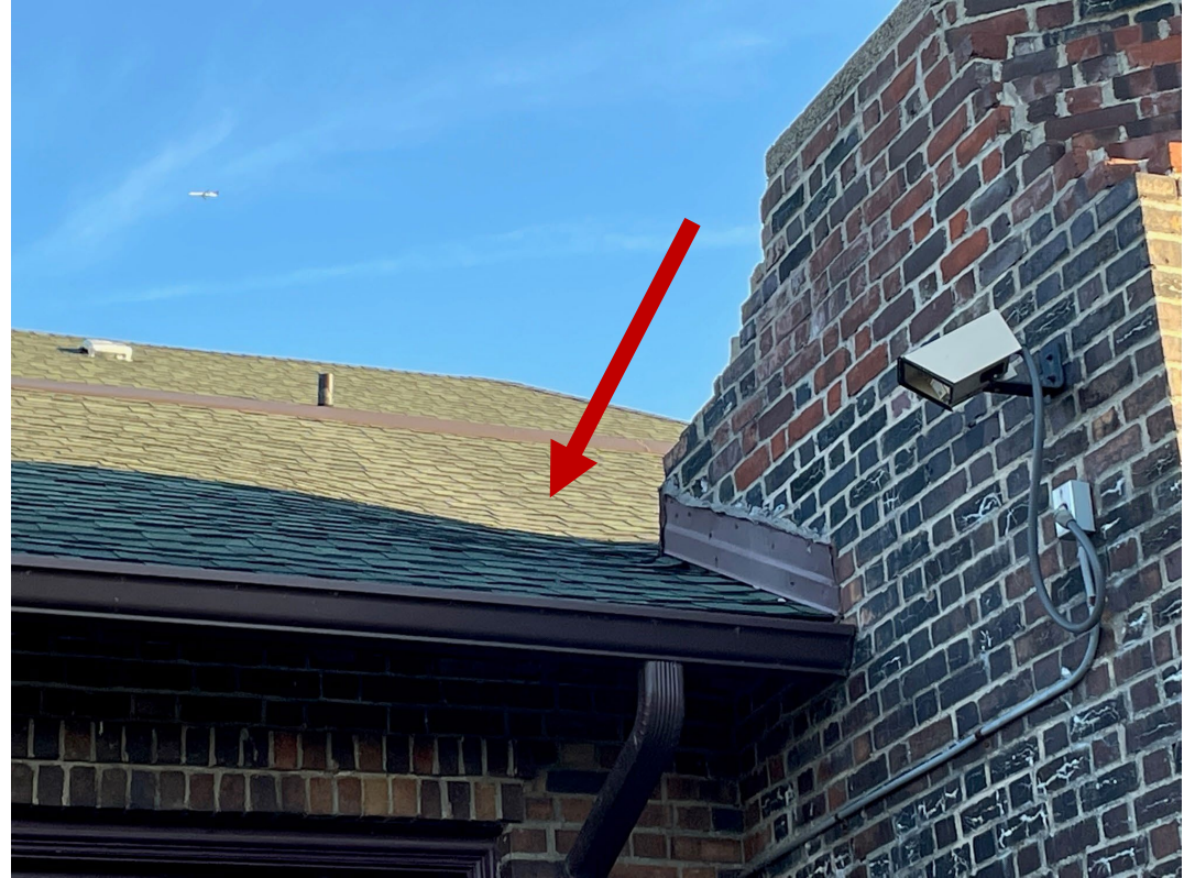
Roof is under- supported and needs replacement and reinforcement to stabilize roof.