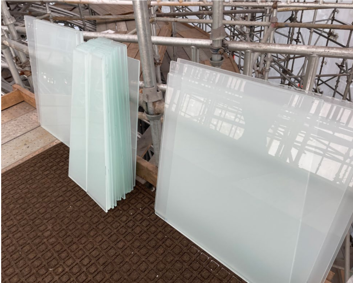
New glass installation in upper dome