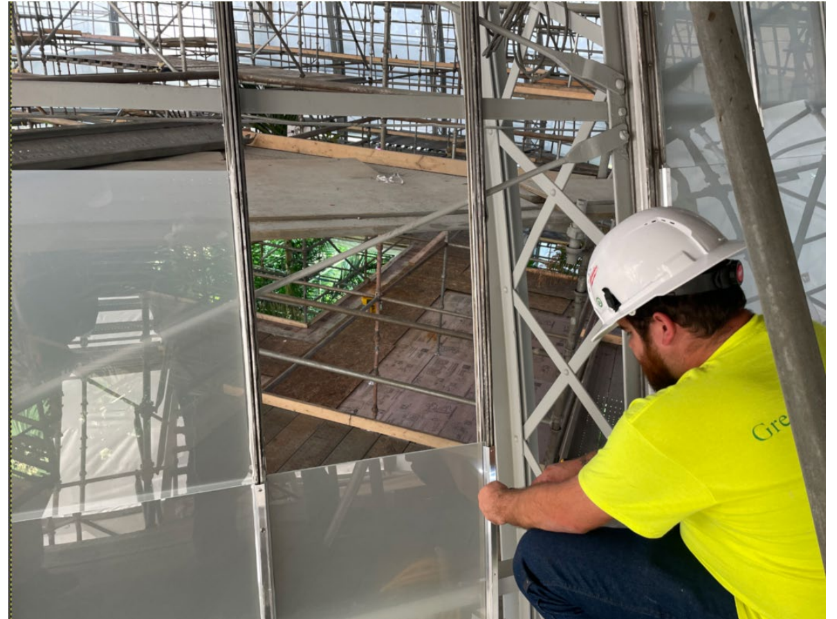
New glass installation in upper dome