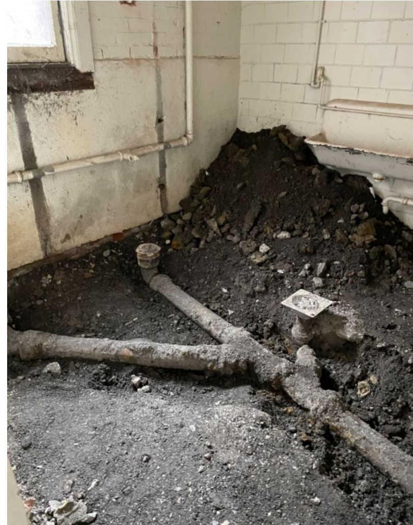
Old sewer line exposed for removal.