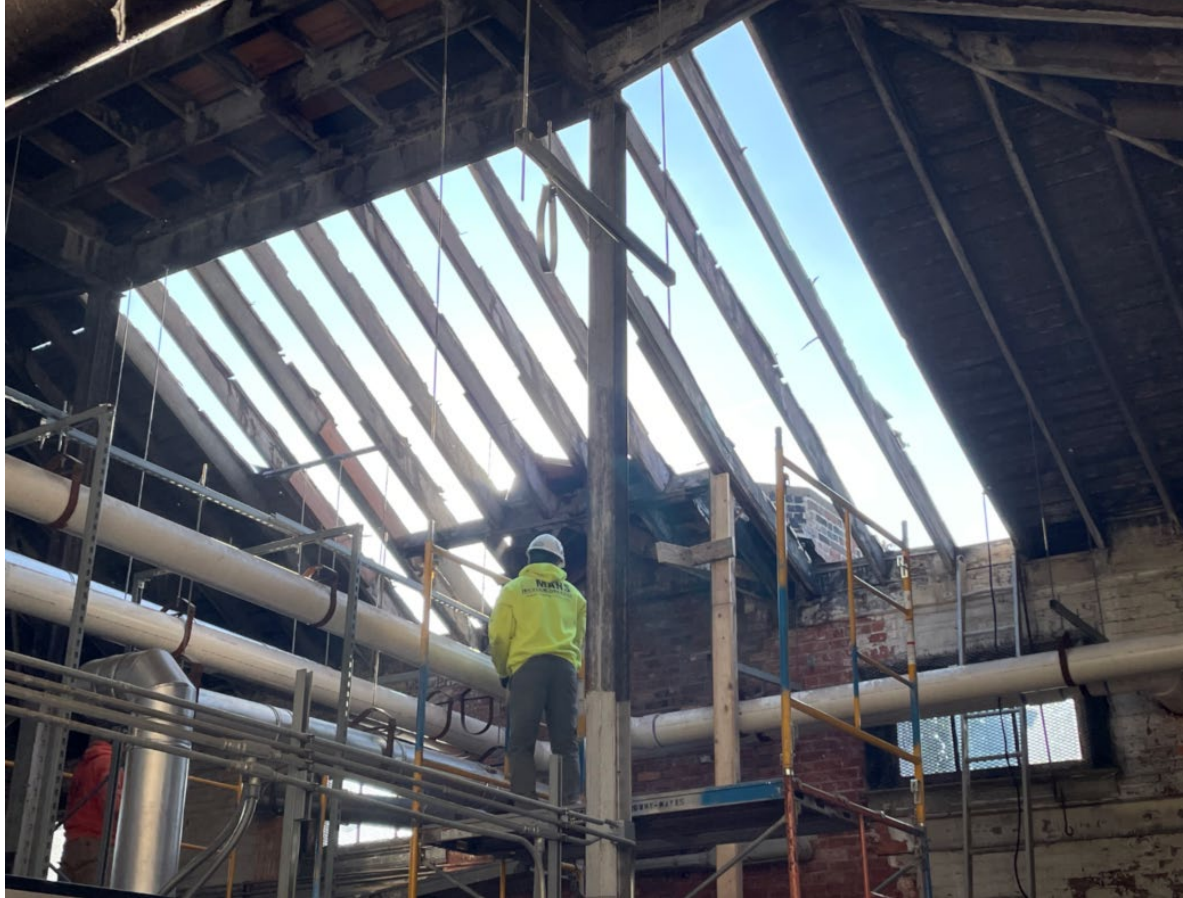
Existing beams open for inspection by structural engineer