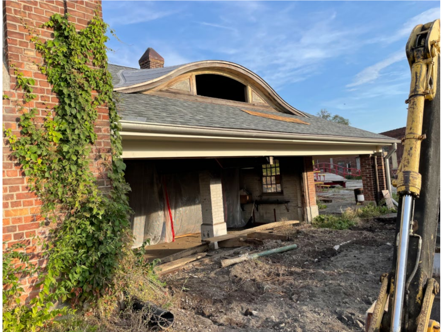
Boarded panels removed and concrete excavation