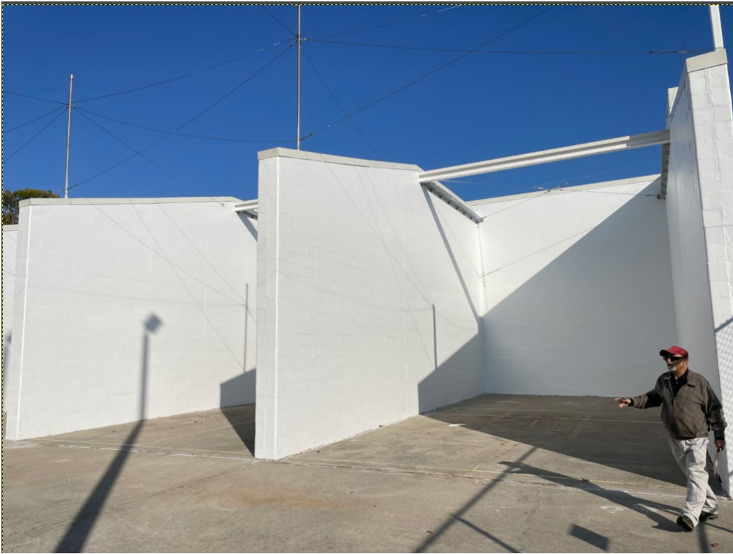
Structural repairs and painting complete