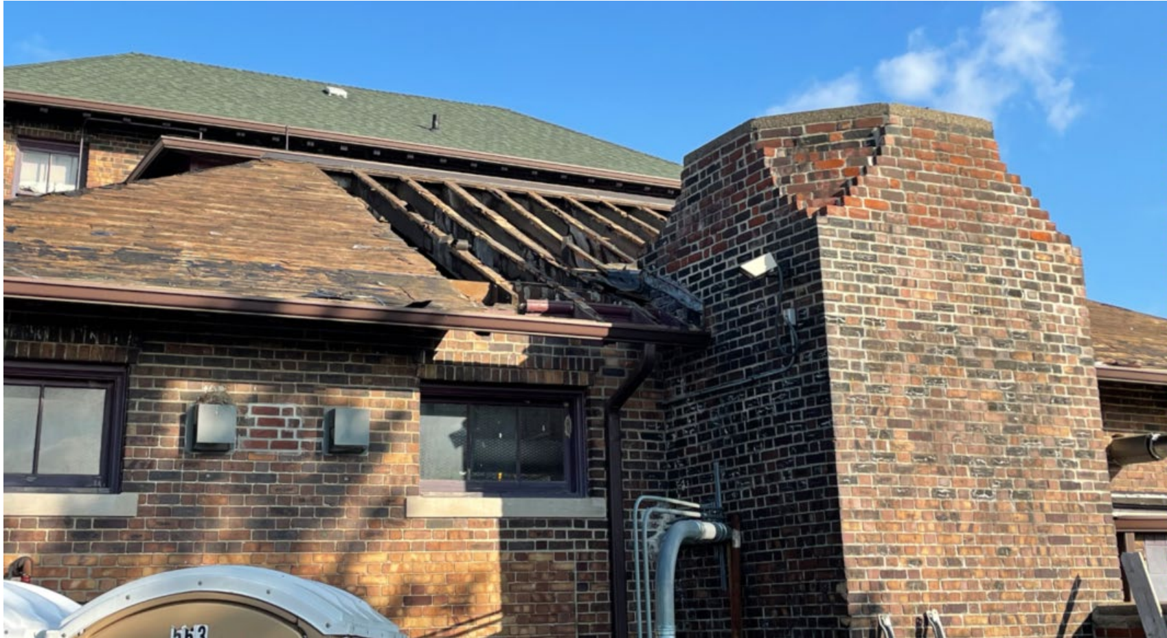
Existing beams open for inspection by structural engineer