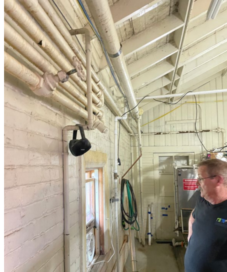
Boiler line valve needs to be replaced.