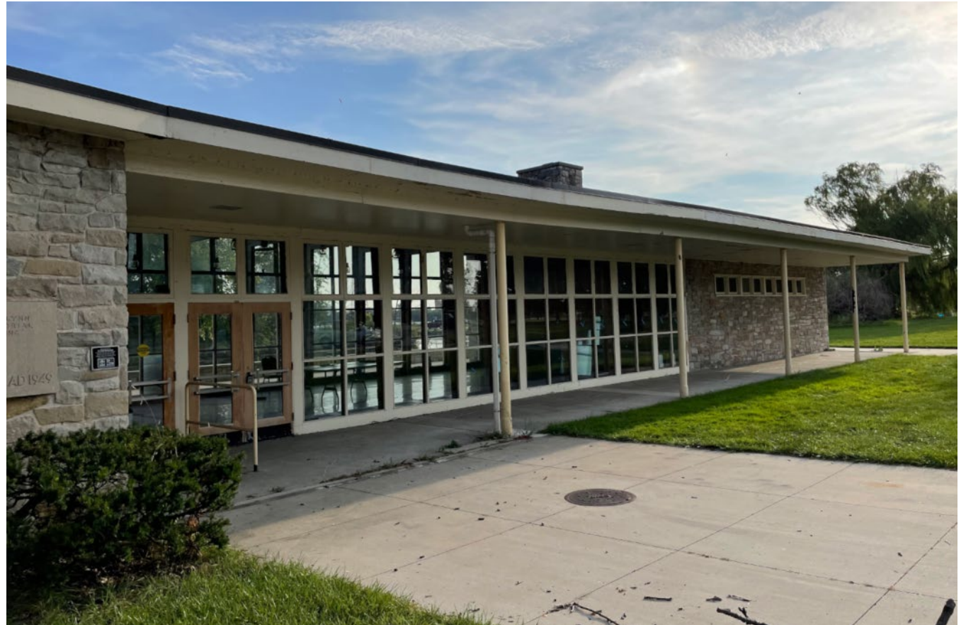
Window and carpentry repairs underway in 2023.