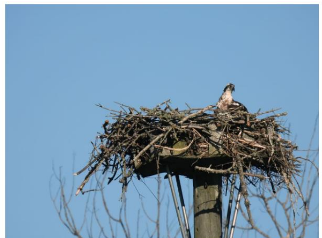
An osprey is shown sitting in its nest on the old nesting platform near the mouth of the Rapid River in Delta County, Michigan. The platform was replaced on March 1, 2023.

Ospreys are recognizable by the elbow bend in their wings that gives them an M-shaped appearance in flight. They also have dark patches under their wings and a brown stripe across their faces. Ospreys can have a wingspan of almost 6 feet. Nesting pairs typically produce two to three chicks.