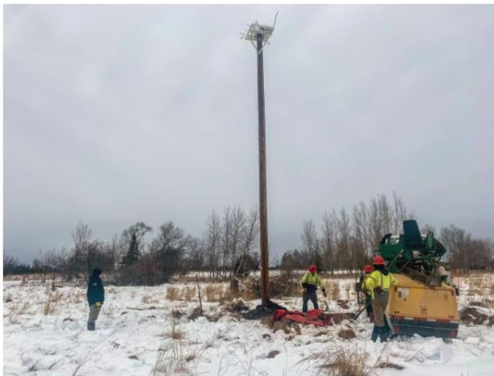
A new osprey nesting platform was installed on March 1, 2023, near the mouth of the Rapid River in Delta County, Mich. Michigan Department of Natural Resources

The 30-foot-tall pole was recently installed near the mouths of the Rapid, Whitefish and Tacoosh rivers, which empty into Lake Michigan at Little Bay de Noc. Atop the pole is a square, metal platform with perching arms that extend nearly 3 feet off the corners, which serves as an ideal place for osprey pairs to build a nest.