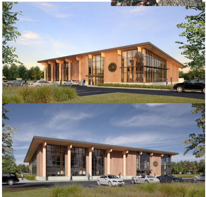
DNR CUSTOMER SERVICE CENTER