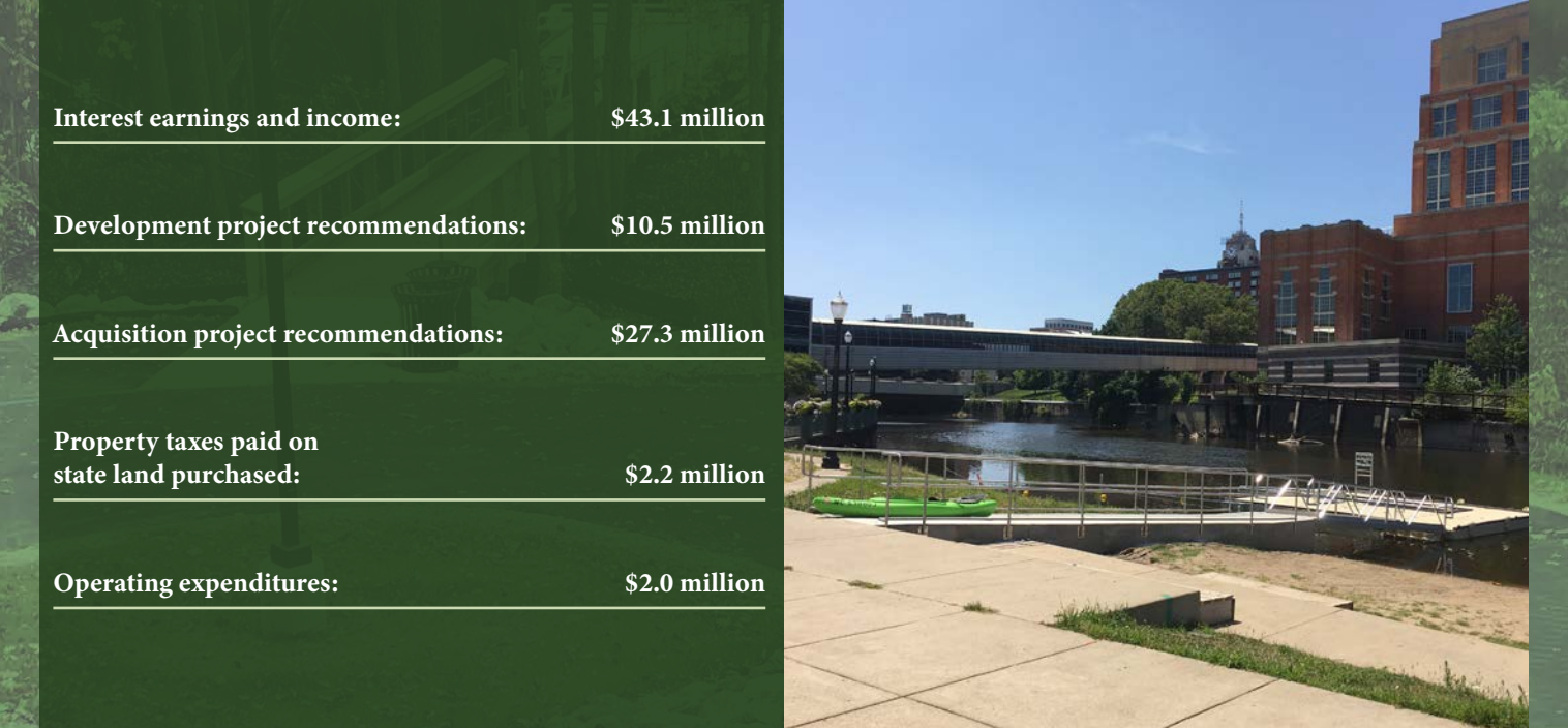
Riverfront Park canoe and kayak launch development, Lansing, Ingham County