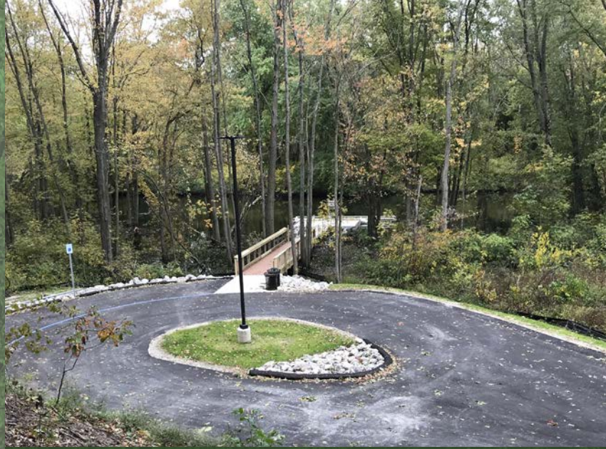
Riverside Kayak Park development, Hagar Township, Berrien County

In May 2011, the corpus of the Michigan Natural Resources Trust Fund reached $500 million and, in accordance with the Michigan Constitution, the funding formula of the Trust Fund changed significantly.