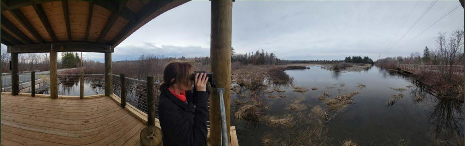
Iron Ore Heritage Trail, Carp River Marsh, Negaunee Township, Marquette County.

The Michigan Department of Treasury manages the investment of the corpus to ensure grants will continue to be available for current and future generations. Adequate fund reserves are present to withstand variations in the market and to allow for continued stability in the fund. This strategy will maintain a vital Trust Fund for years to come. The estimated fiscal year 2022 ending investment balance of the Trust Fund is $585.1 million.