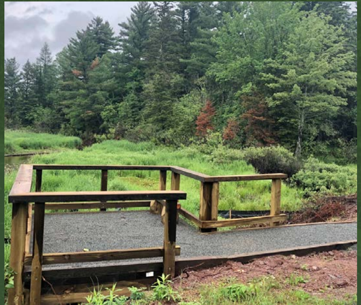
Iron Ore Heritage Trail, accessible fishing platform on the Carp River, Negaunee Township, Marquette County.

* Includes an unrealized investment loss of $89 million