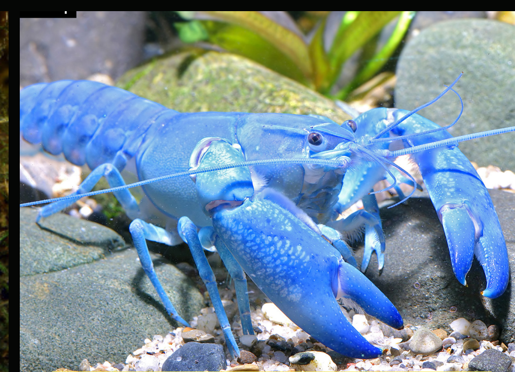
PROHIBITED Common Yabby Crayfish Cherax destructor (not yet in Michigan)