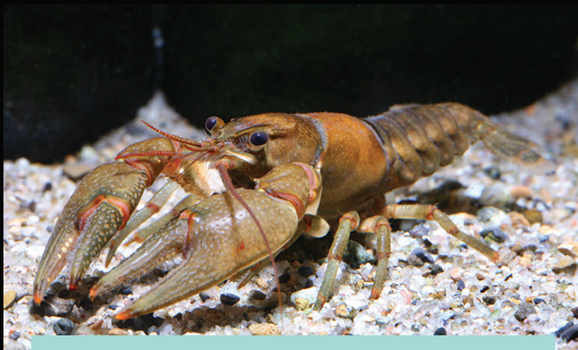
Northern Clearwater Crayfish Faxonius propinquus