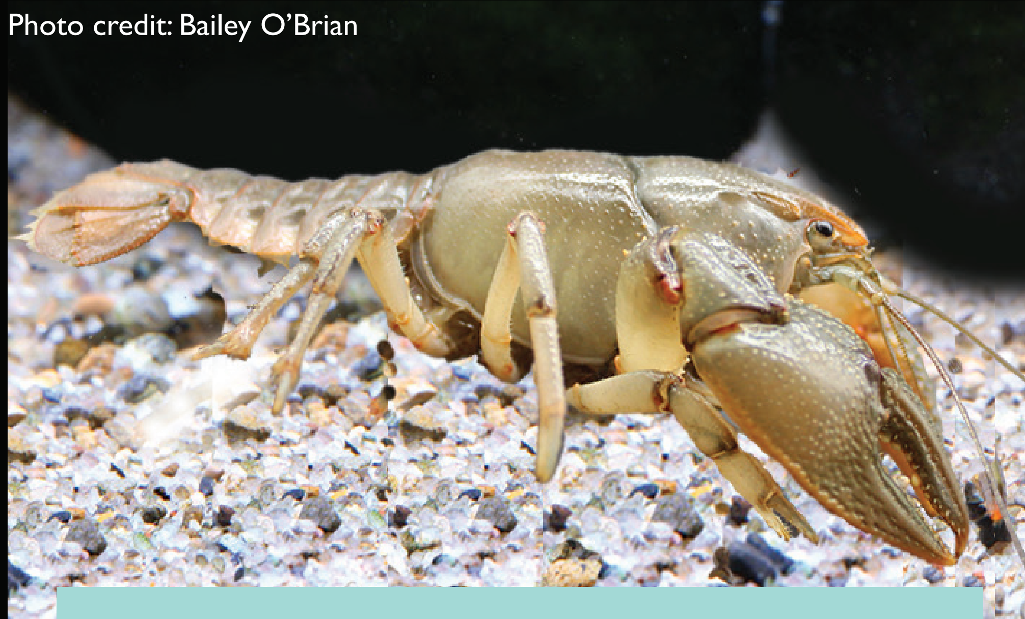
Great Plains Mudbug Lacunicambarus nebrascensis