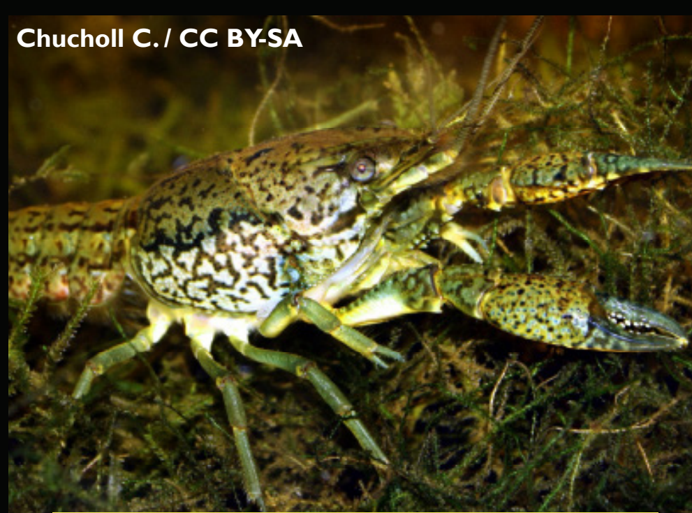
PROHIBITED Marbled Crayfish Procambarus virginalis (not yet in Michigan)