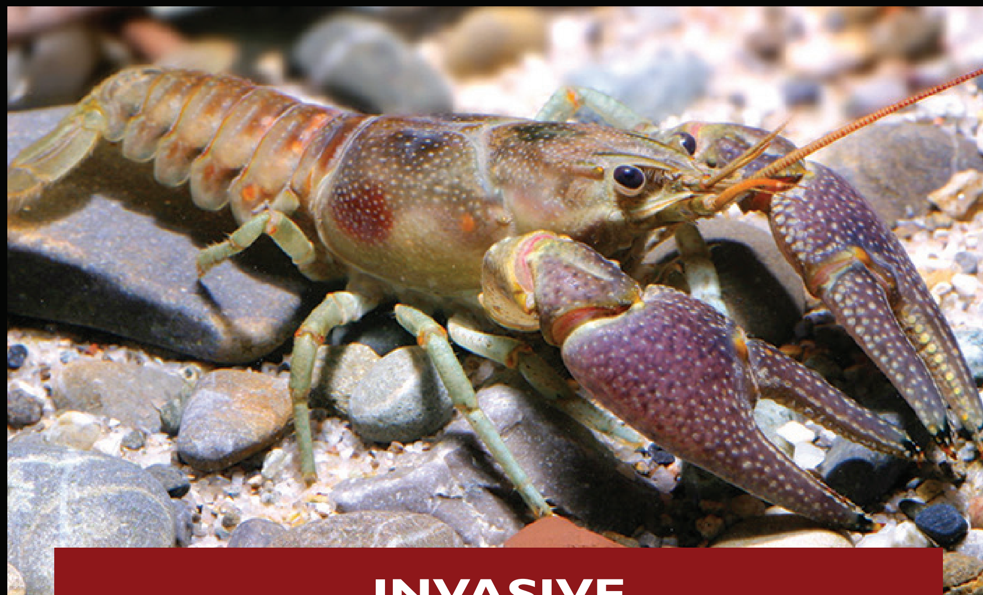
INVASIVE Rusty Crayfish Faxonis rusticus