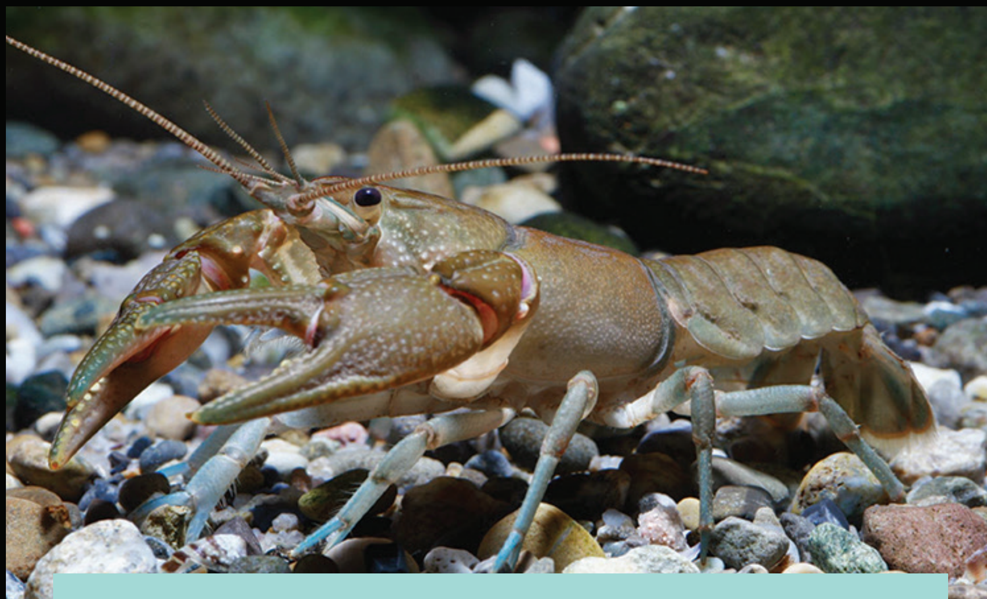
Big Water Crayfish Cambarus robustus