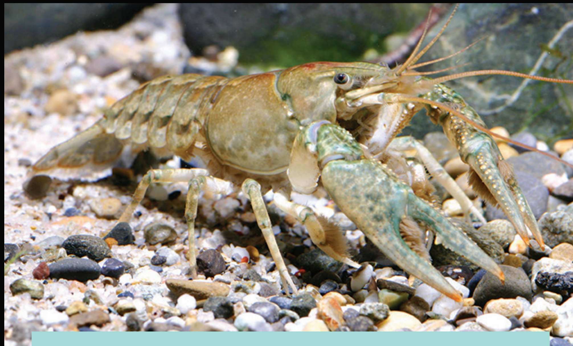
Calico Crayfish Faxonius immunis