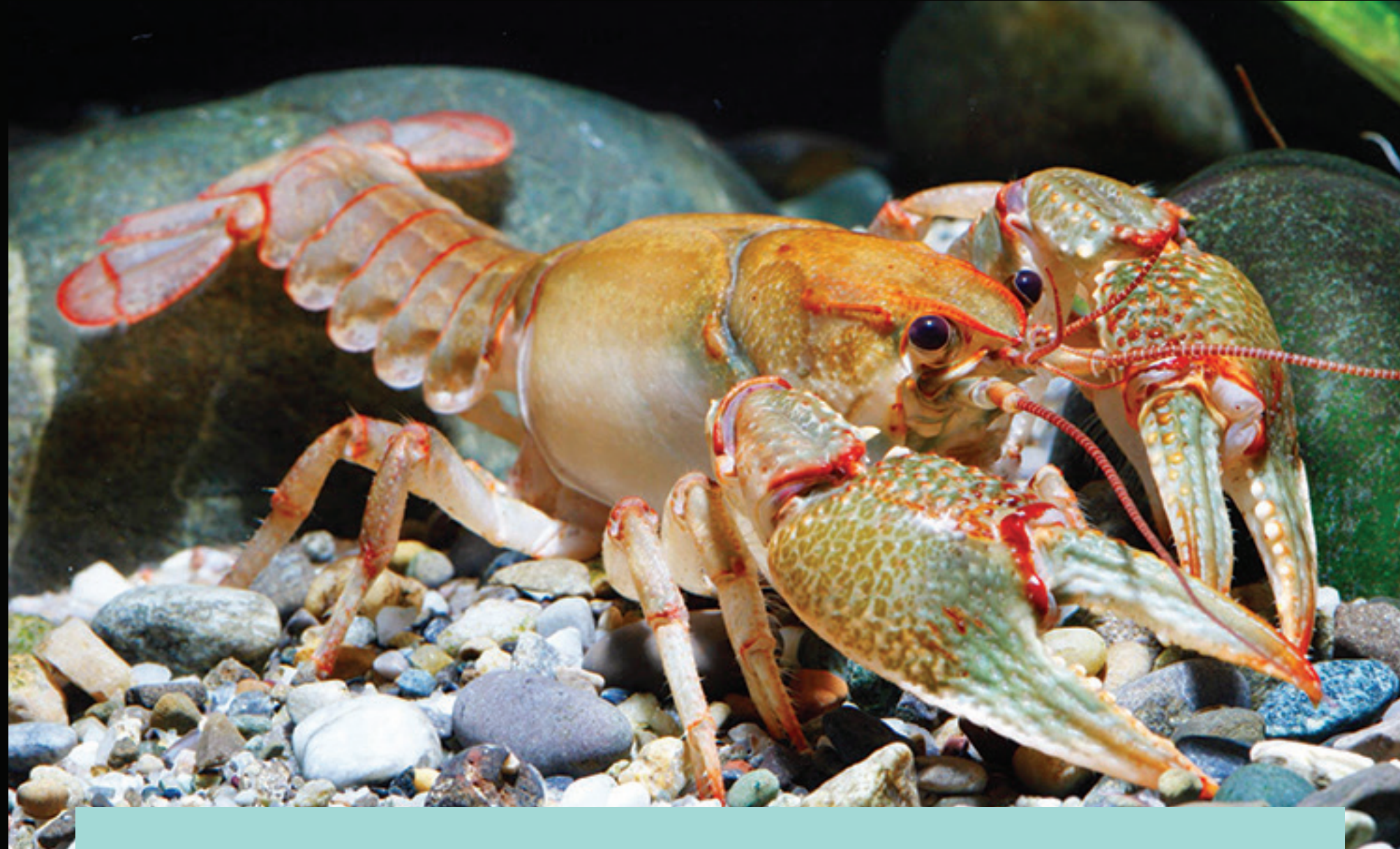
Paintedhand Mudbug Lacunicambarus polychromatus