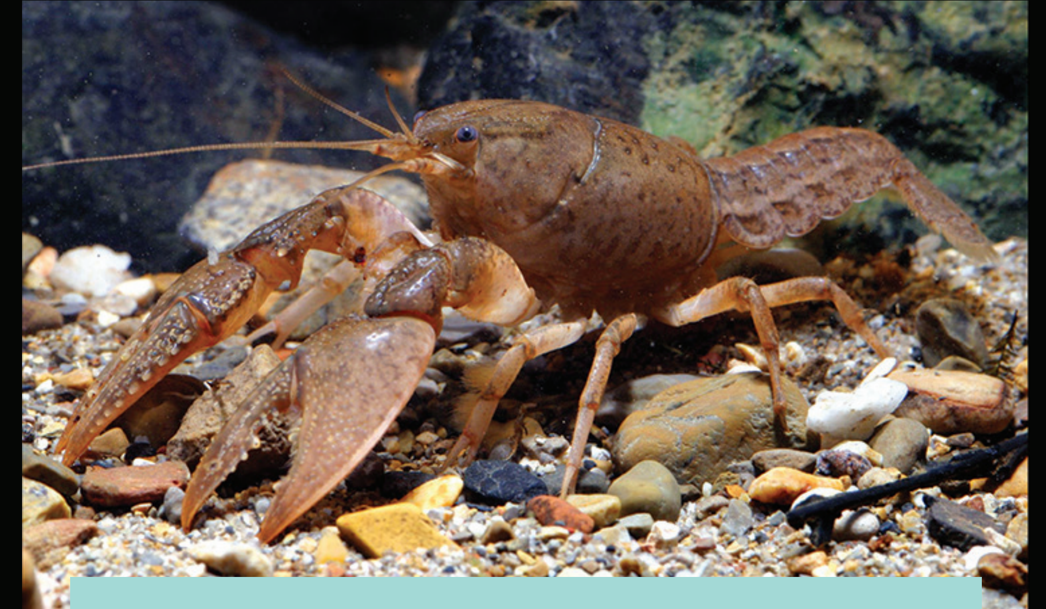
Digger Crayfish Creaserinus fodiens