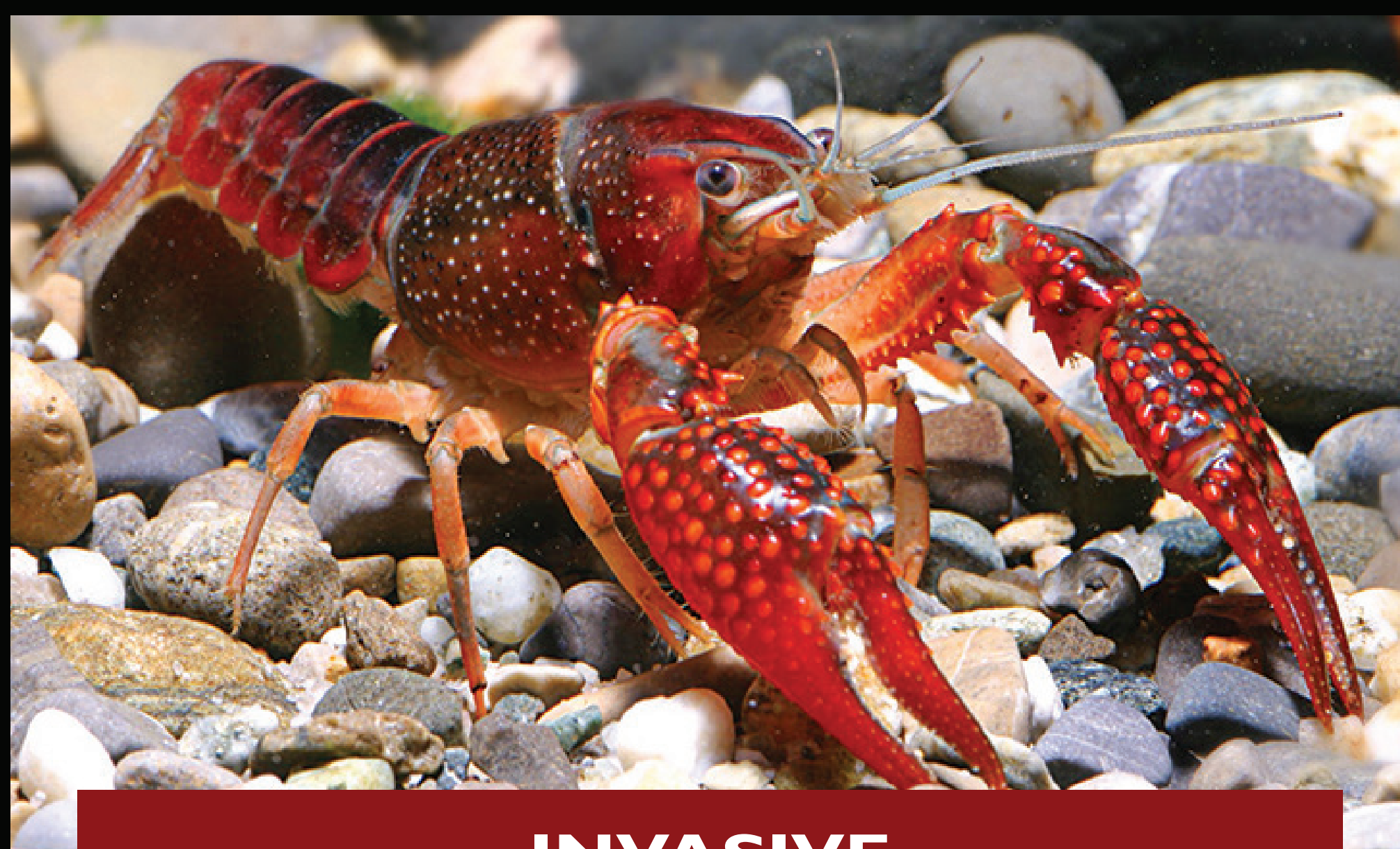
INVASIVE Red Swamp Crayfish Procambarus clarkii