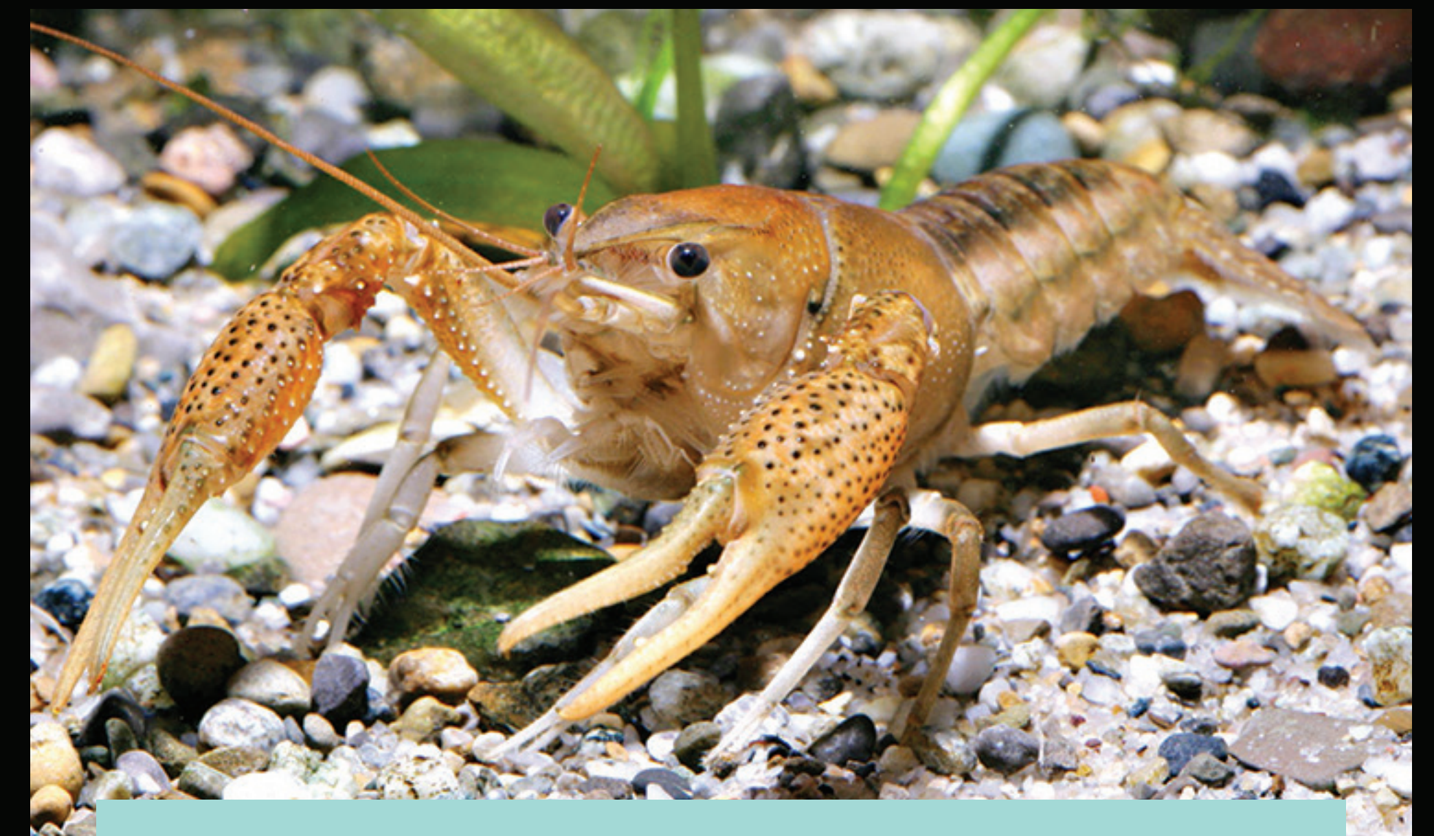
White River Crayfish Procambarus acutus