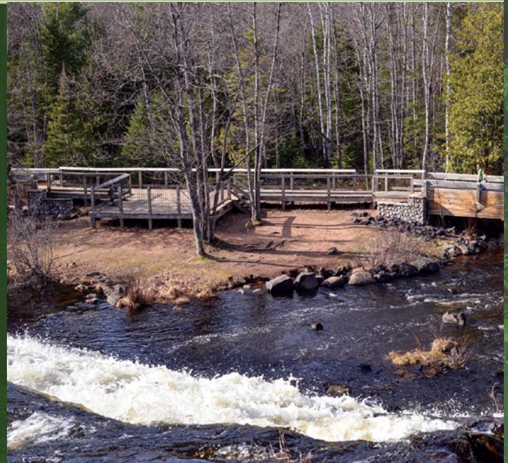
Bond Falls Scenic Site, Ontonagon County