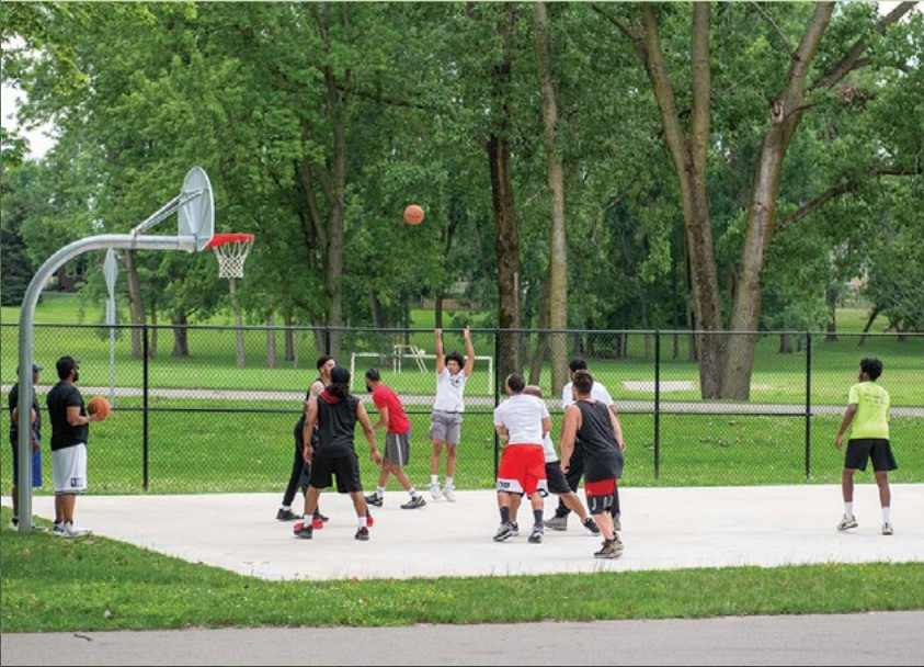
Delta Mills Park, Eaton County

In May 2011, the corpus of the Michigan Natural Resources Trust Fund reached $500 million and, in accordance with the Michigan Constitution, the funding formula of the Trust Fund changed significantly. New revenue from state-owned oil, gas and other mineral production stopped being deposited into the Trust Fund and started to be deposited in the State Parks Endowment Fund. Funds available for grants from the Trust Fund, as well as payments in lieu of taxes and administrative costs, now come from interest and earnings on these invested funds.