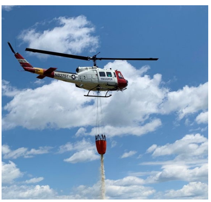
A "Bambi bucket" is used to drop water on wildfire.

A collaboration between the Michigan State Police and DNR allowed agencies to use a helicopter and water-filled "Bambi bucket" to assist with suppression and drop water on two fires.