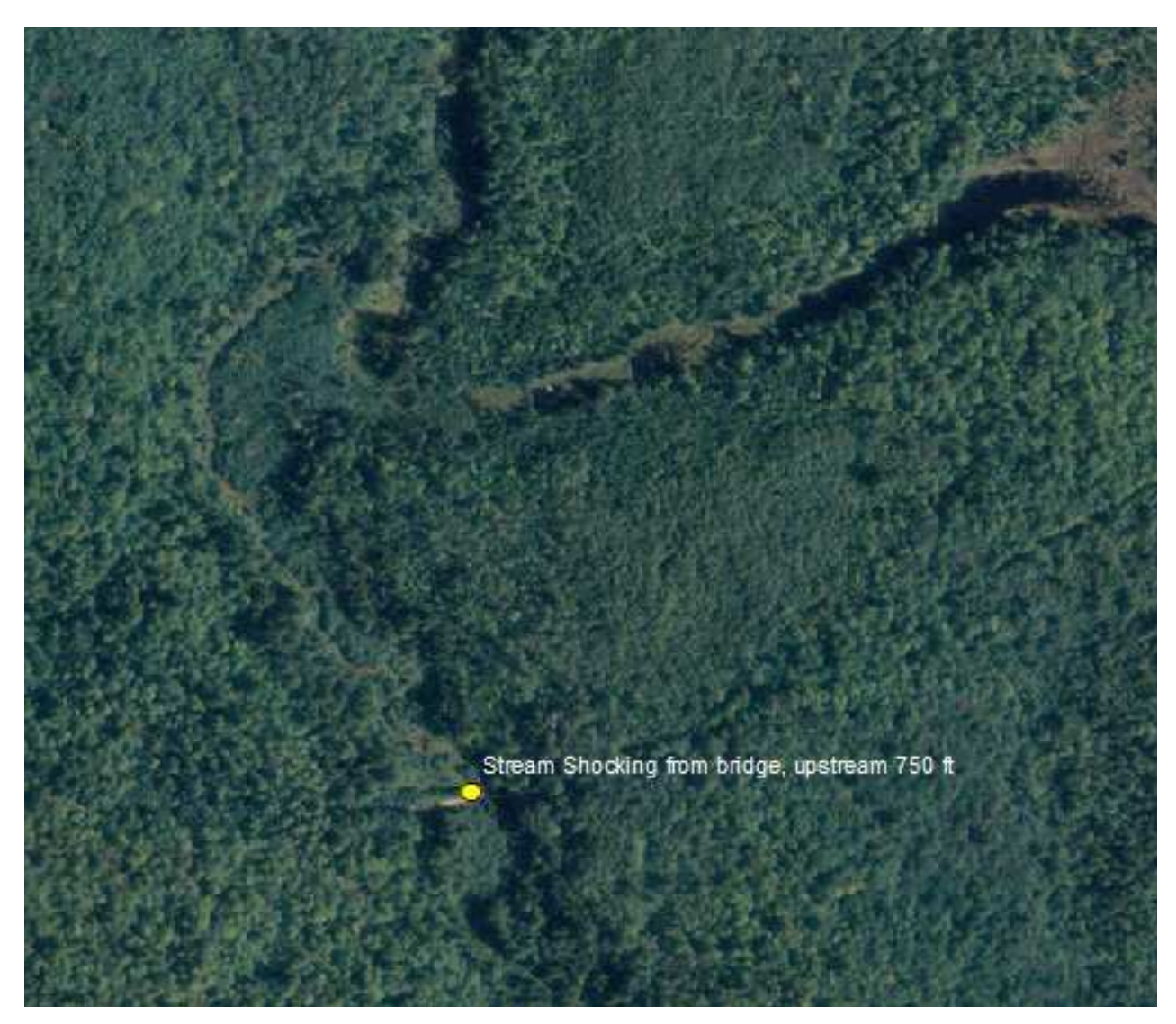
Figure 2. Aerial photograph of Silver Creek, Luce County, showing starting point for September 9, 2009 stream shocking survey, beginning at Silver Creek Road bridge, and extending upstream 750 ft.