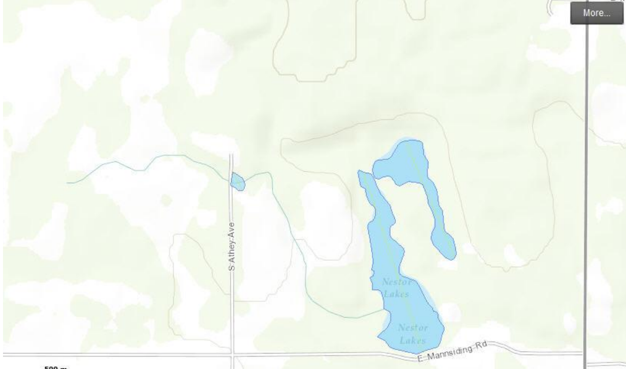
Figure 2. Location of Nestor Lake, Clare County