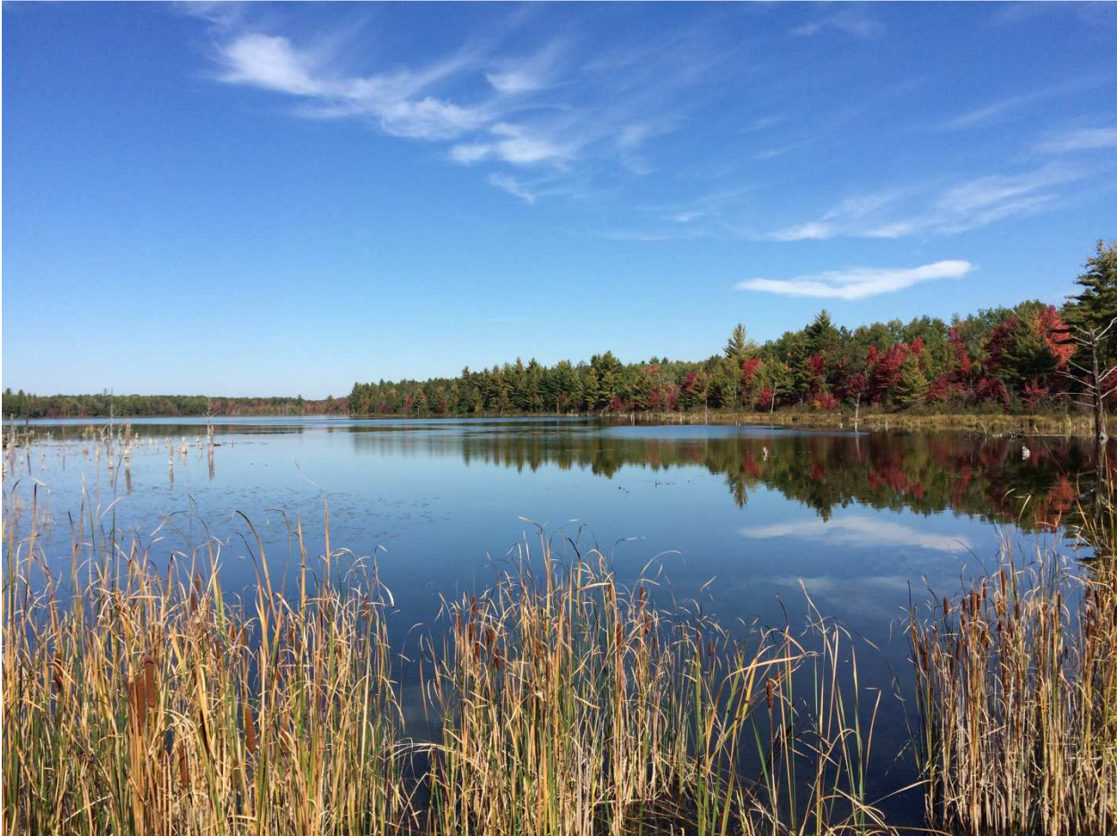
Photo 1. Roberts Lake, Cheboygan County.