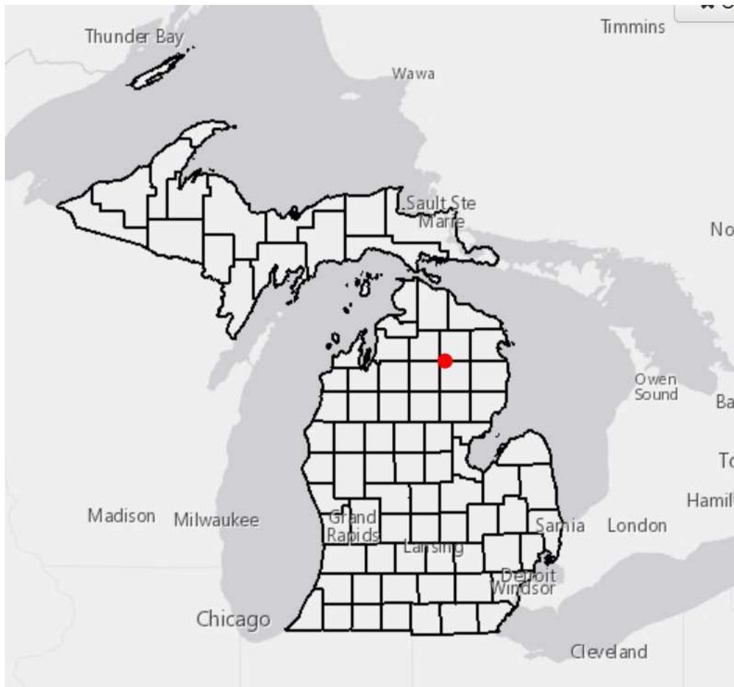
Figure 1. Location of Little Wolf Lake in Michigan (lake noted by the red dot).