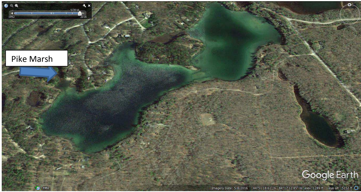
Figure 2. Aerial view of Little Wolf Lake, Montmorency and Oscoda counties, from satellite images.