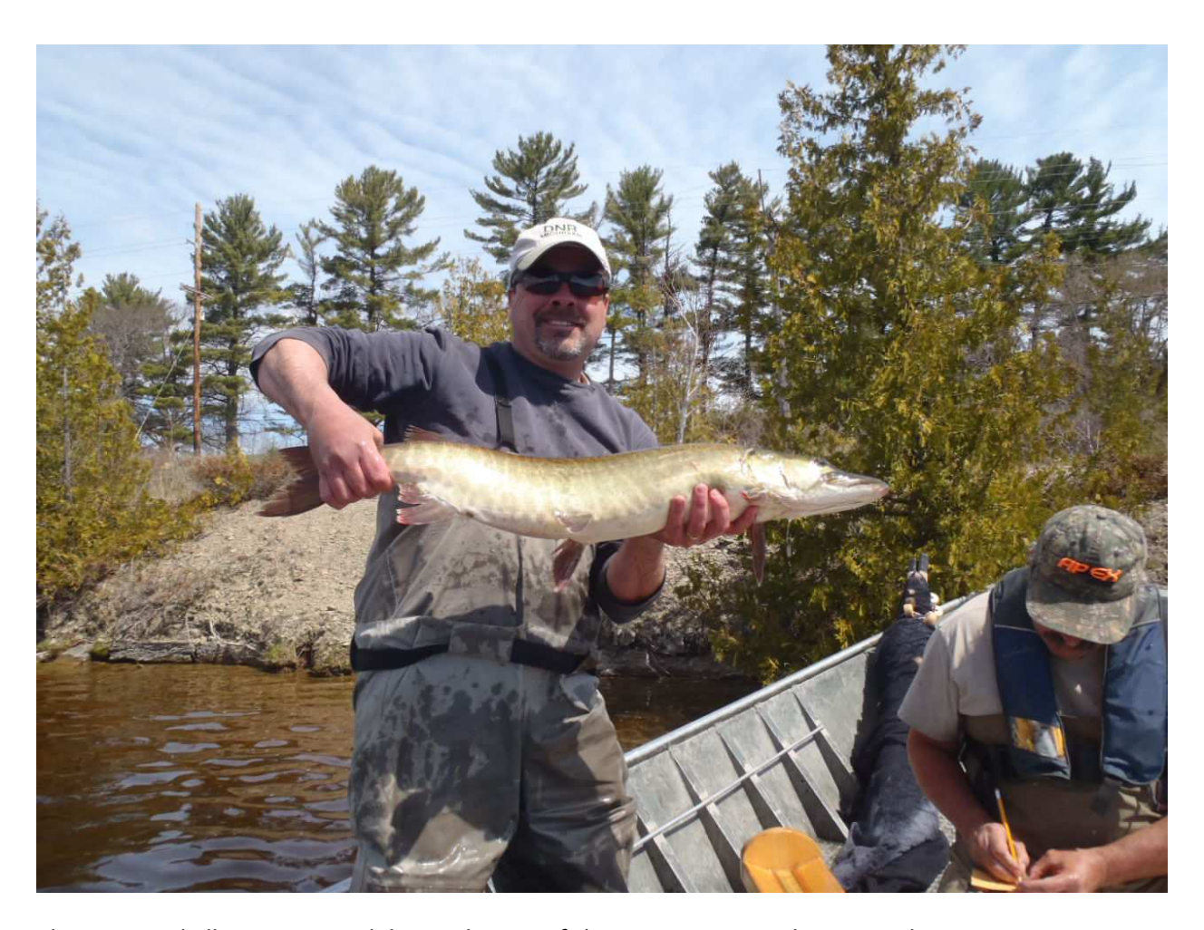
Photo 3. Muskellunge captured during the 2016 fish survey at Four Mile Impoundment.