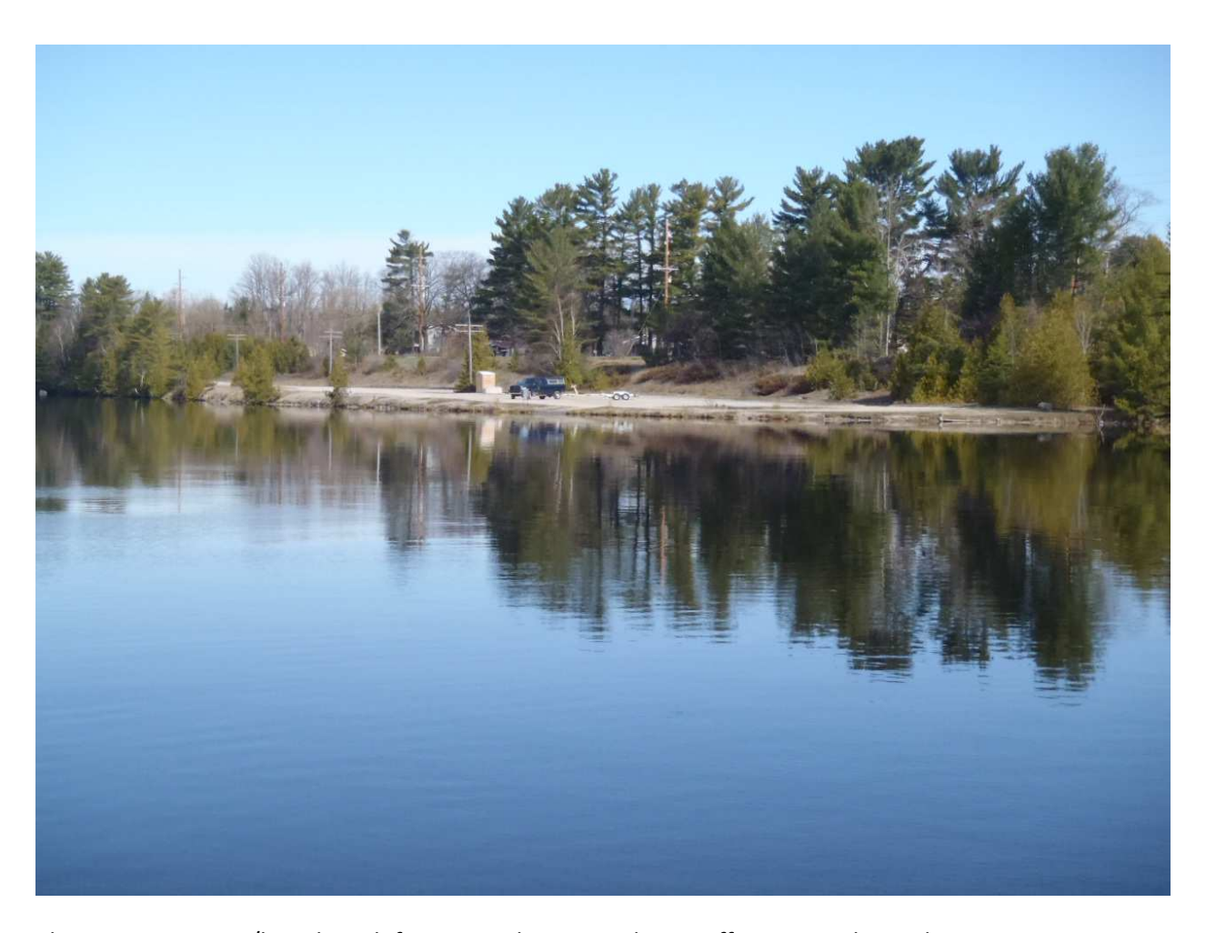
Photo 1. Access site/boat launch for Four Mile Impoundment off Long Rapids Road.