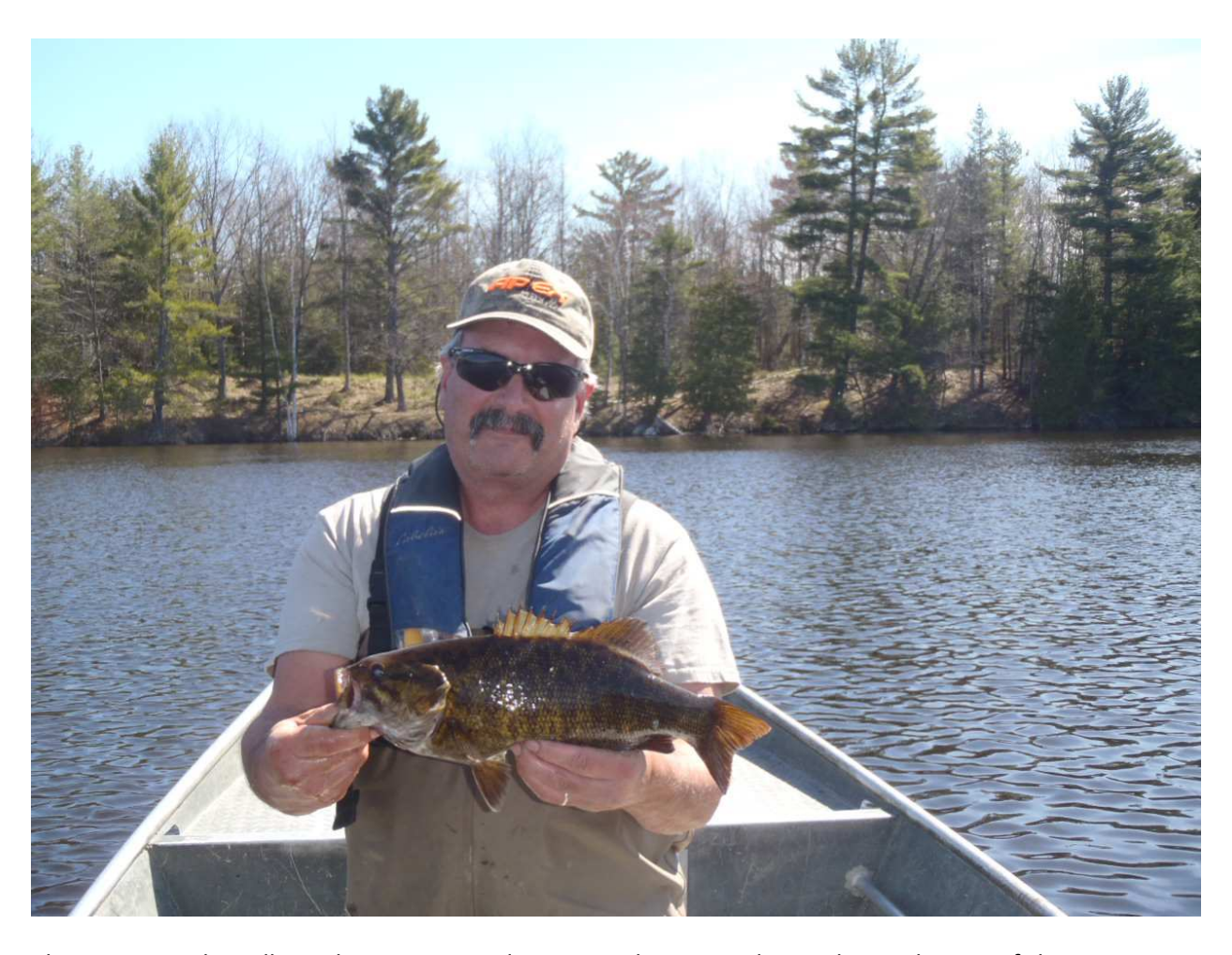
Photo 2. Typical Smallmouth Bass captured at Four Mile Impoundment during the 2016 fish survey.