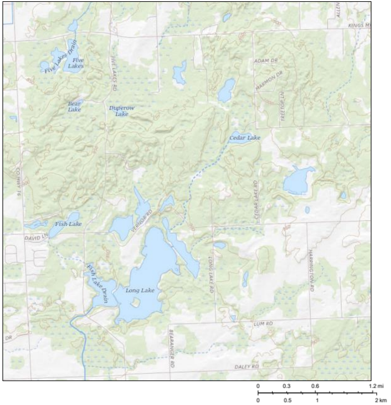
Figure 1. Cedar Lake in Lapeer County, Michigan.