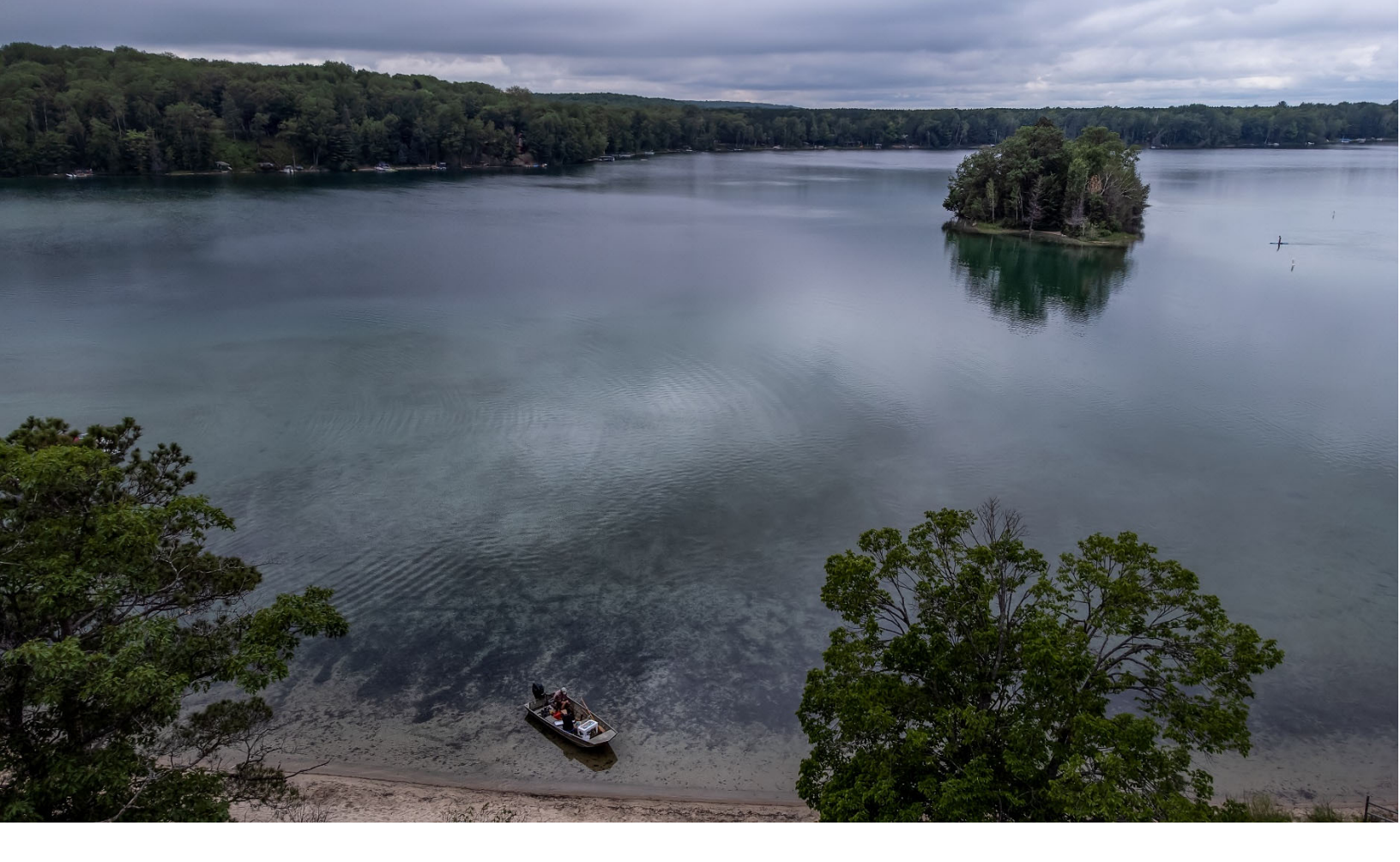
2022 Fisheries Habitat Grant Program