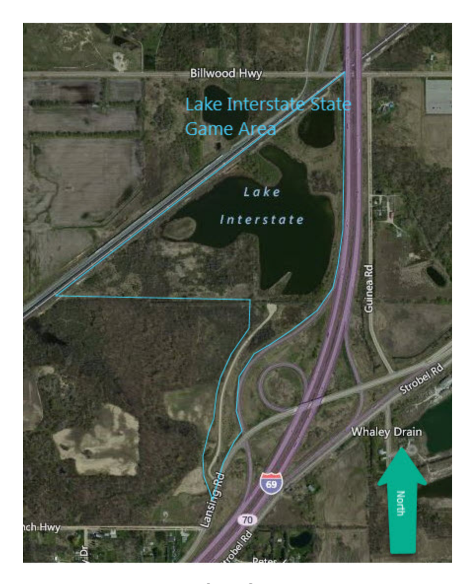
Figure 2. Lake Interstate State Game Area aerial photograph.