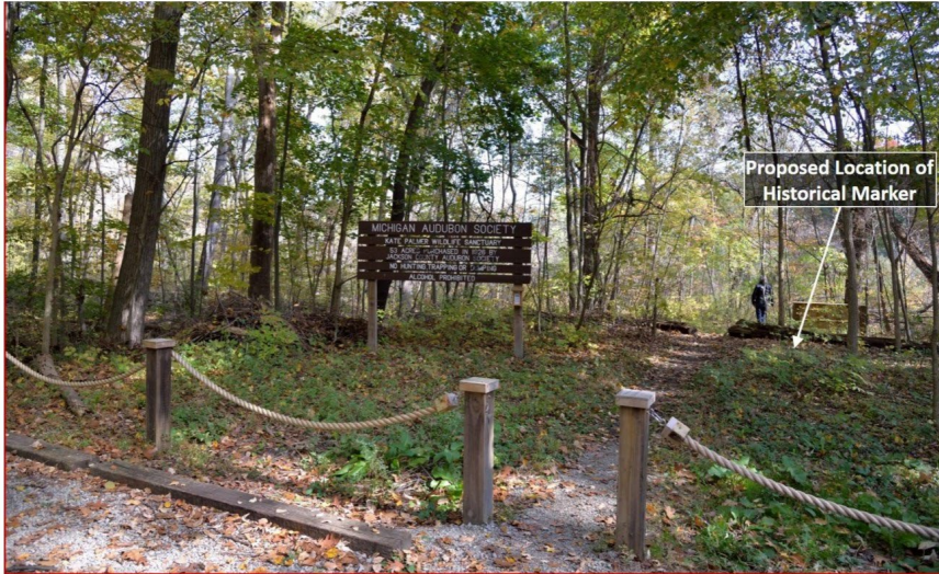
Figure 7. Proposed Location for State Historical Marker.

Proposed Marker Location: The entrance to the sanctuary.