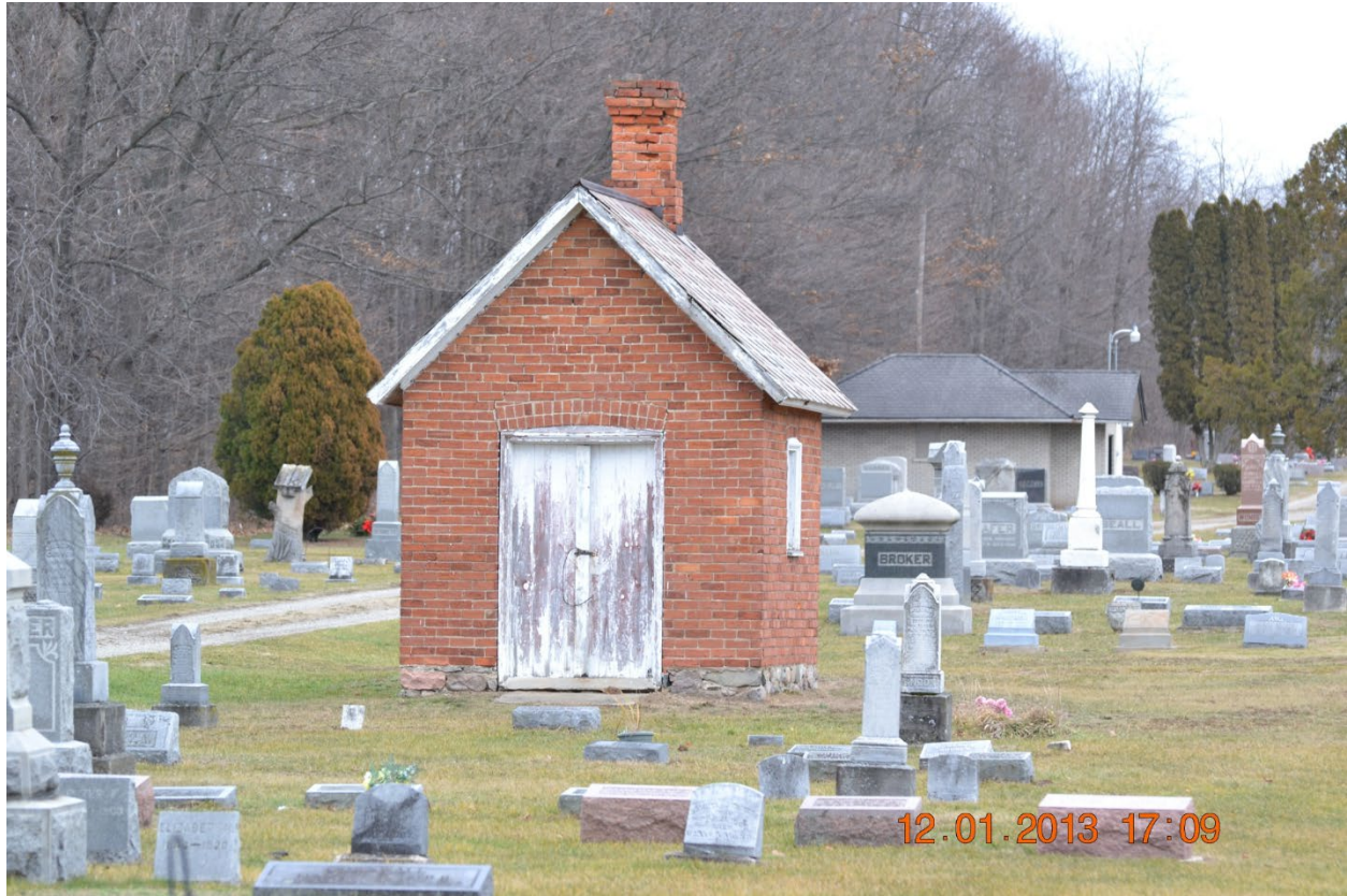
-The equipment shed