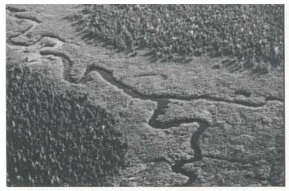
Tributary streams, including Cold Creek (center), are the building blocks of the Fox River System.

Due to tannins from swampy areas, these waters are naturally low in productivity. Acid rain precipitation has further reduced the carrying capacity of these waters. The ability to sustain fish life in these lakes in the future is questionable due to the relatively low buffering capacity of their water.