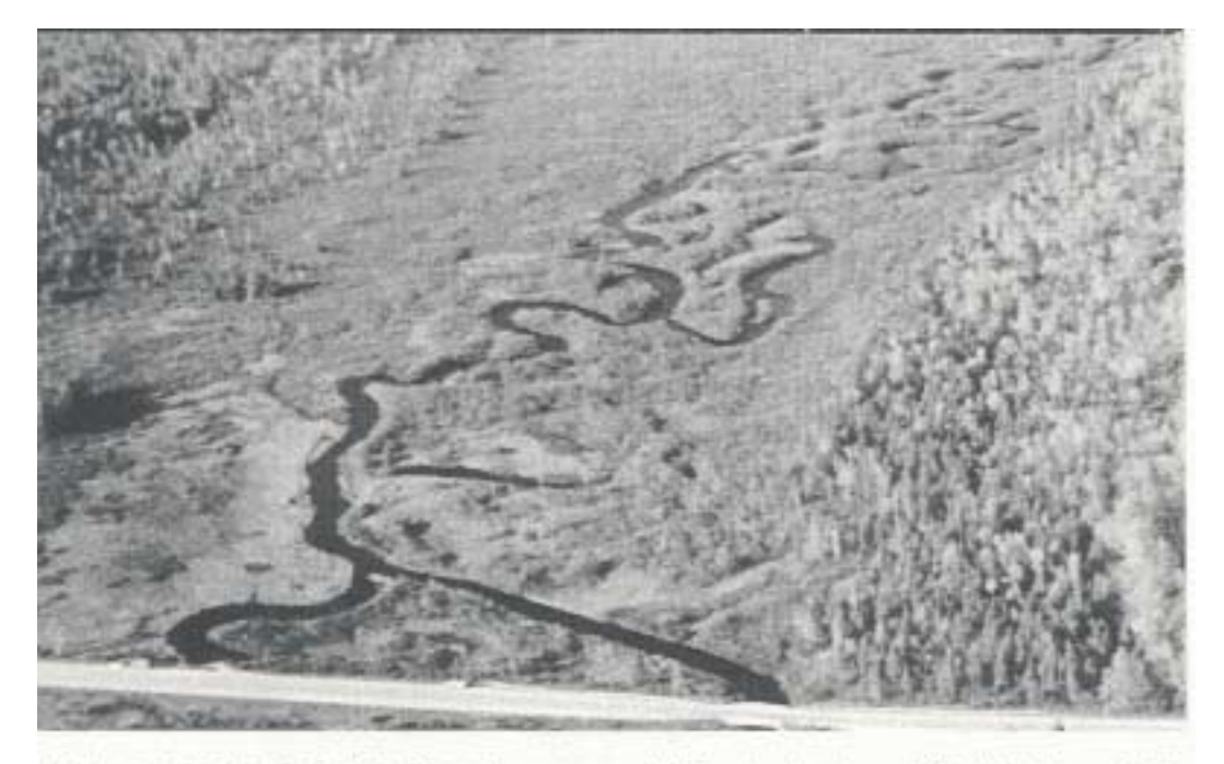
Boat access to the East Branch occurs at this dead channel (left) along M-28. Several oxbows (former channels) can be seen at the upper right.

Public access sites to the River are numerous, but mostly undeveloped.