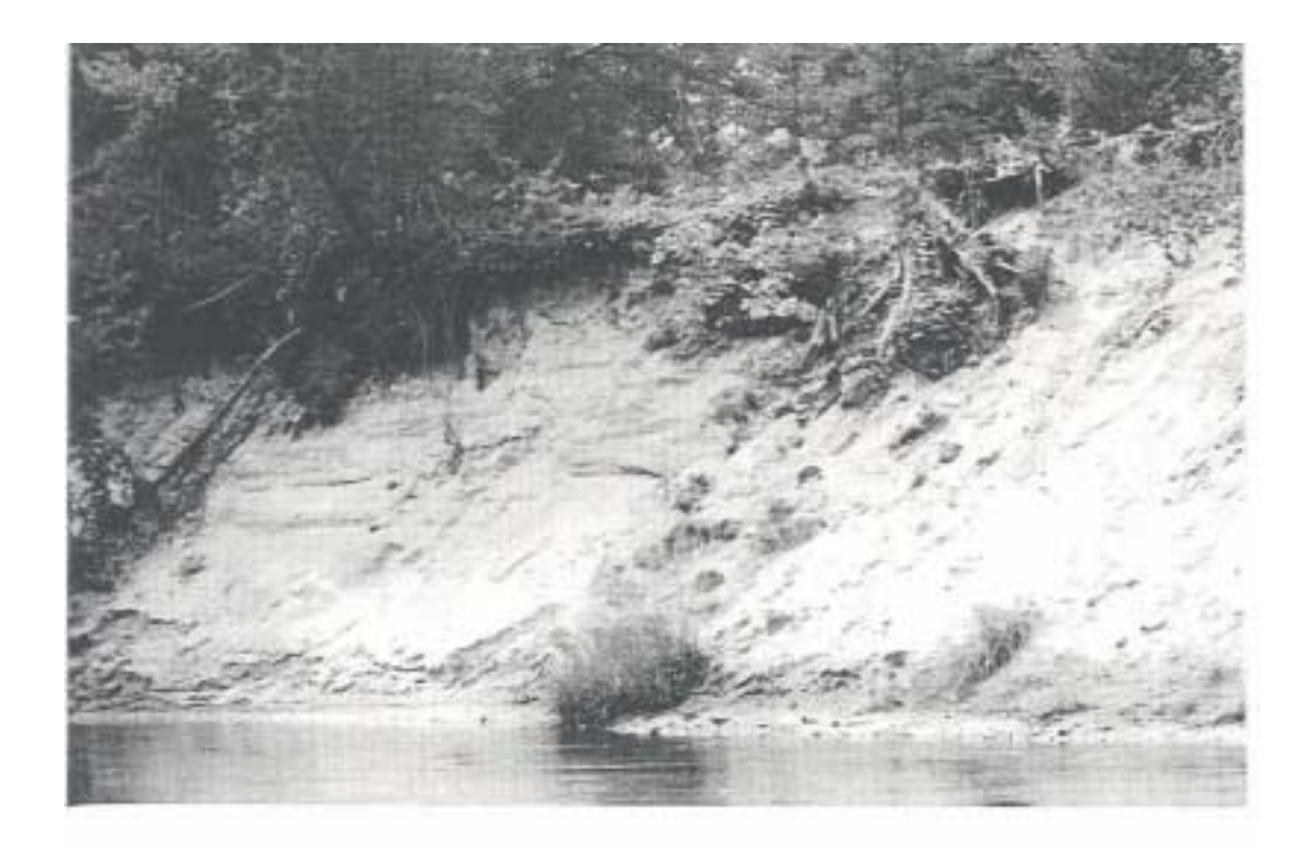
The Upper Fox Mainstream has numerous high sandy banks. Erosion from these areas covers gravel spawning sites and suffocates aquatic organisms.

Many other animals are commonly found along the Fox River. Songbirds include those that inhabit both boreal and deciduous forests. White-throated sparrow, nuthatch, black-capped chickadee, and woodpeckers are all common. Birds of prey include the red-tailed and broad-winged hawk, and the barred owl.