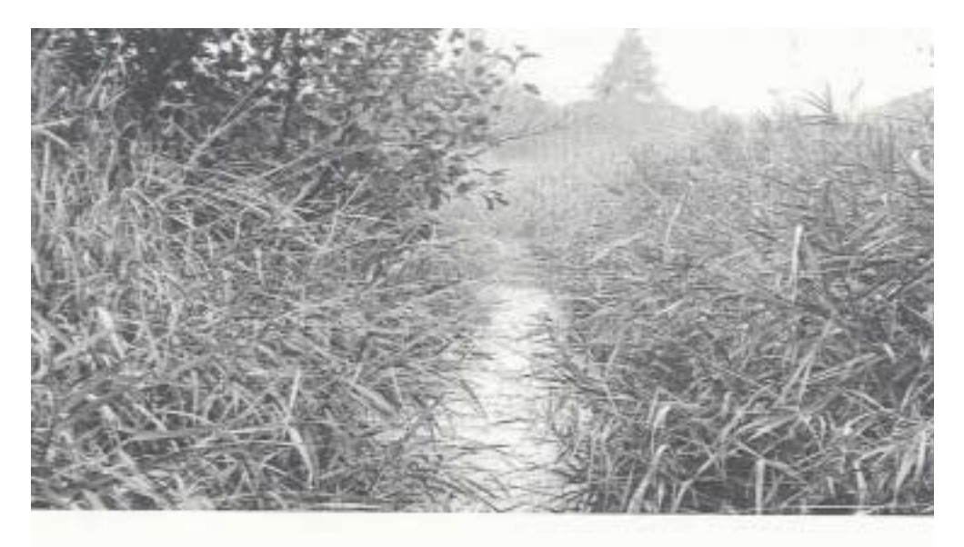
. . . while other stretches of The Spreads contain no large channel, only numerous smaller ones generally parallel to each other.

Extensive stream improvement work was done from 1947 to 1953 by the Department of Conservation (DNR) under the old Lake and Stream Improvement Program. Work was done on the upper Mainstream, upper East Branch, West Branch, and Little Fox. Earlier work was also done by the Civilian Conservation Corps in the Middle and late 1903s. The list of activities included placement of wing deflectors, log deflectors, digger logs, stump covers, and sodden log covers, plus riprapping, seeding, or sodding banks, planting willows, and constructing rush mat bank covers.