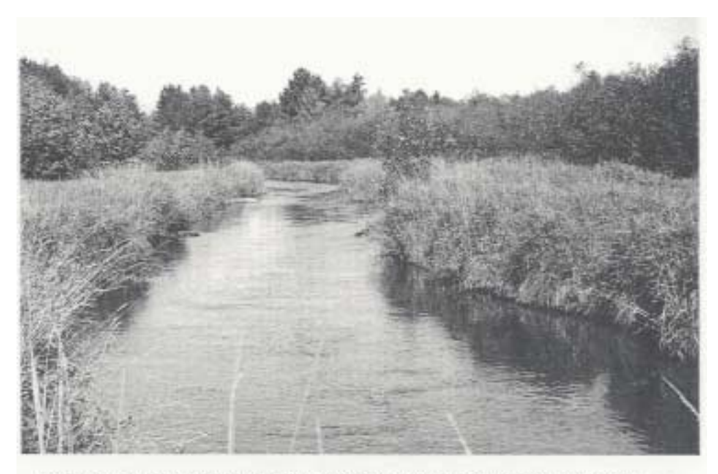
Portions of The Spreads contain one major channel and several small ones. . .

Extensive stream improvement work was done from 1947 to 1953 by the Department of Conservation (DNR) under the old Lake and Stream Improvement Program. Work was done on the upper Mainstream, upper East Branch, West Branch, and Little Fox. Earlier work was also done by the Civilian Conservation Corps in the Middle and late 1903s. The list of activities included placement of wing deflectors, log deflectors, digger logs, stump covers, and sodden log covers, plus riprapping, seeding, or sodding banks, planting willows, and constructing rush mat bank covers.