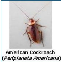
American Cockroach ( Periplaneta Americana )

Look for six legs and two long antennae; some have wings; they are reddish-brown, grey-tan, dark brown or black. Cockroaches are about 1/2 inch to 1 1/2 inches long.