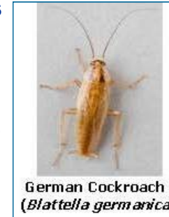
German Cockroach ( Blattella germanica )

Pesticides are poisons, so follow label directions and use them carefully. Don't use pesticides around food or on food preparation surfaces. Keep children and pets away from areas where pesticides have been applied, as the label requires.