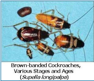
Brown-banded Cockroaches, Various Stages and Ages ( Supella longipalpa )

You may also find cockroach eggs. Eggs are contained in oval "casings," about 1/4 to 1/3 of an inch long. They are light to dark brown or black, but may look dusty. Cockroaches carry egg casings attached to their bodies, or drop them in out of the way places.