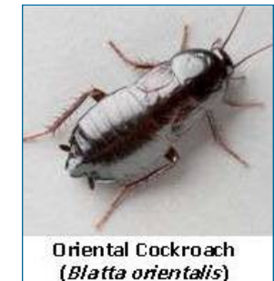
Oriental Cockroach ( Blatta orientalis )

You could also hire a professional pest control company to help you.