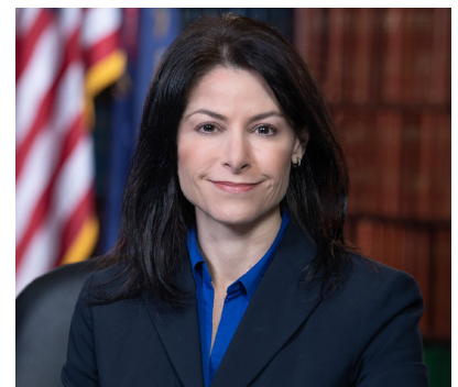
Dana Nessel Attorney General

Consumer Protection Division P.O. Box 30213 Lansing, MI 48909 517-335-7599 Fax: 517-241-3771 Toll free: 877-765-8388 Online complaint form