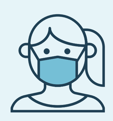
Wear mask except when eating or drinking