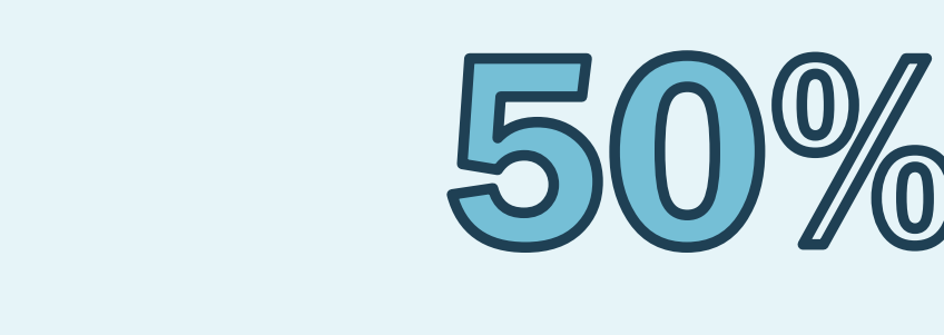
Limit to 50% capacity and no more than 100 people