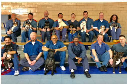
Newberry Correctional Facility received eight rescue Husky and Australian Shepard puppies on March 8.