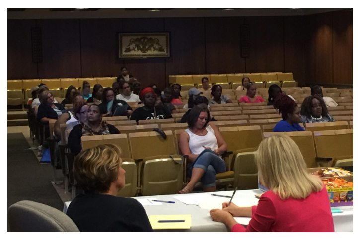
Committed to Protect, Dedicated to Success