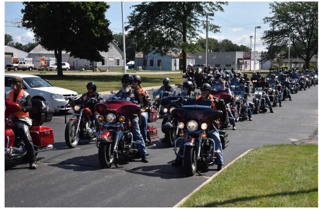
Motorcycle riders depart for the start of the 11th annual Mary's Dream fundraising ride in Mount Pleasant.

a way to stay engaged with her coworkers through an activity they all loved — riding their motorcycles.