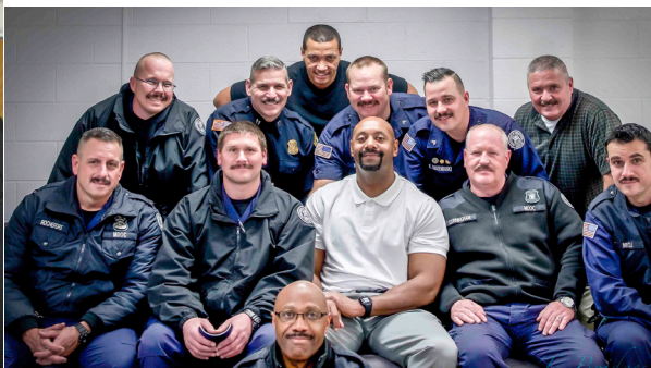
Other SAI staff that participated in the Movember mustache challenge.

Staff at Special Alternative Incarceration Facility raised money for prostate cancer research in the month of November. Staff grew moustaches and donated money to help spread awareness of prostate cancer. They awarded trophies for best and worst moustache. In total they donated over $700 to the Prostate Cancer Foundation. 82 cents of every dollar goes directly to cancer research.