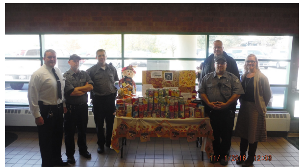
Harvest Gathering donations at Ionia Correctional Facility

This year, the goal of Harvest Gatherings was to raise 2 million meals for the State of Michigan. That goal was not only met, but surpassed. The final total for the Harvest Gathering included $267,798 and 400,214 pounds of food. With this amount of money and food, The Michigan Harvest Gathering can provide nearly 2.6 million meals to those in need. This year, donations were also made to The Greater Lansing Food Bank. The donations included not only food, but personal items. The final total of the personal items was over 11,000 pounds, which surpasses 2015's donation by 3,000 pounds.