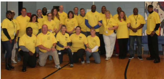
Staff members involved with One Day With God

On October 1st, One Day With God, a program that helps inmates reconnect with their children, made a stop at Carson City Correctional Facility. Staff members from Central Office, Carson City Correctional Facility and G. Robert Cotton Correctional Facility helped to support the event. One Day With God has made a positive impact on many inmates and their family members' lives.