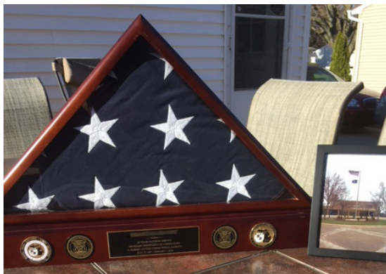
An example of a display presented to a retiree

"They showed me what it was to be a C/O," he said. "They showed me you have to have heart and you have to have your partner's back."