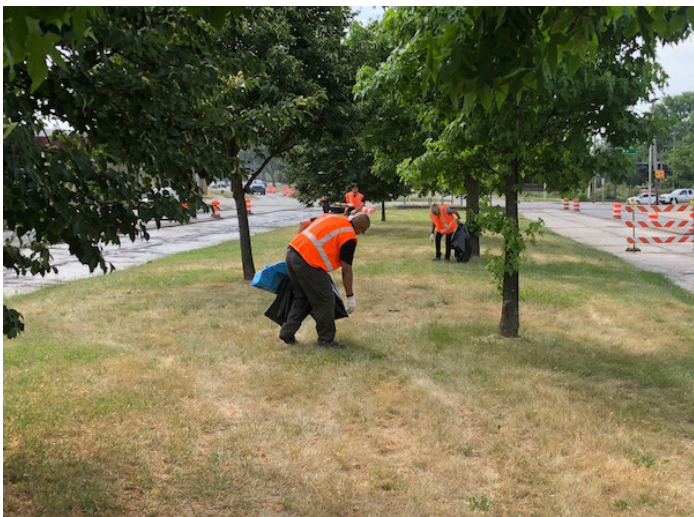
Southwest District probation agents and offenders clean a stretch of road in Wayne County together.