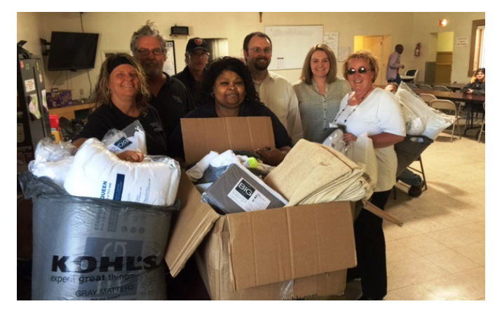
Committed to Protect, Dedicated to Success

On June 1, employees gave a total of 238 pairs of socks, 20 pillows, 24 bath towels, 10 hand towels, 32 wash cloths and 9 sets of sheets to the Interfaith Shelter and Aware Shelter in Jackson.