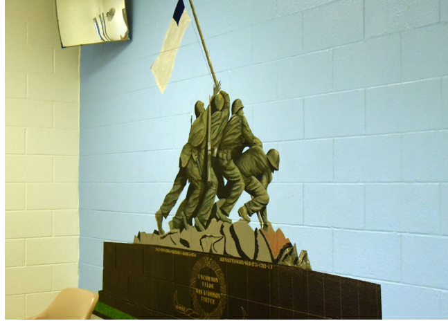
Above: A mural in progress in the new veterans housing unit.