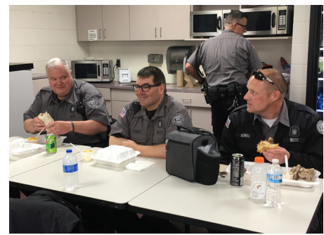
The Muskegon Correctional Facility Employees Club provided lunch for all staff during the appreciation week. Meals were provided by Bone-Ends food truck.