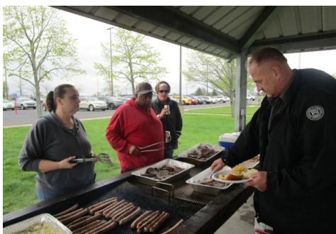
St. Louis Correctional Facility had week-long events that included a cook out, pizza, cookies, root beer floats and chips and cheese for staff.

National Correctional Officers and Employees Week was held May 6-12 this year and a number of work sites, including many correctional facilities, held special events to express their gratitude to staff for their hard work.