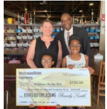
Metropolitan Territory field offices donated $725 to support the Downtown Boxing Gym's Books Before Boxing program.