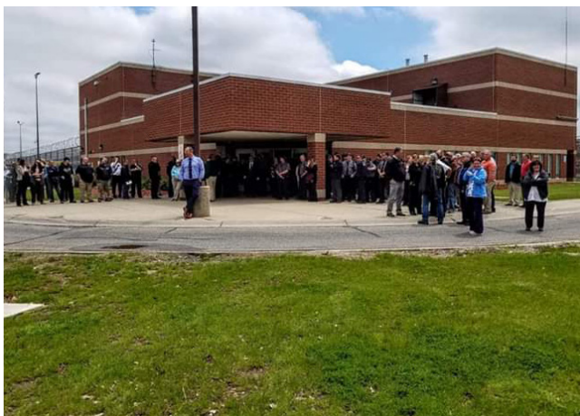
Pictured: Staff at Carson City Correctional Facility gather outside to honor the grandson of a retired employee who was diagnosed with DIPG, a rare form of brain cancer. Staff made the boy an honorary corrections officer and Michigan State Industries made him his own uniform.

"It was very emotional seeing my colleagues showing up to support