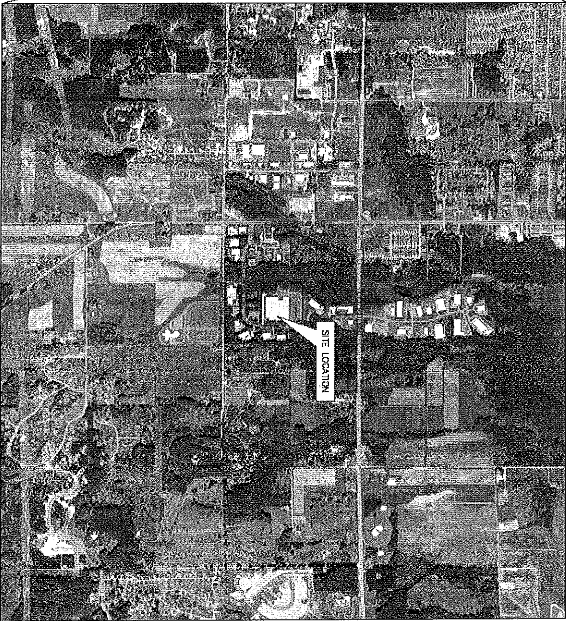
REFERENCE AERIAL FROM GOOGLE EARTH PRO, DATED: JUNE 1, 2005