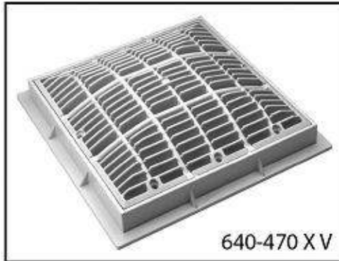
640-470 X V