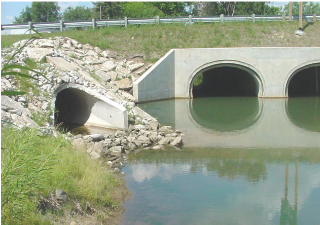
Figure 2. Culvert, riprap, and drain downstream from the intersection of Zeeb Road and Honey Creek (site 15), Washtenaw County, Mich., July 29, 2003.

seepage runs were made during good weather when there was no wet atmospheric input into the watershed. From potential evapotranspiration values published on the World Wide Web by Michigan Automated Weather Network (Michigan State University, 2003), estimated instream evapotranspiration in the time between upstream and downstream measurements was estimated as two or more orders of magnitude less than the streamflow in Honey Creek, and therefore was considered negligible for gain-loss computations.