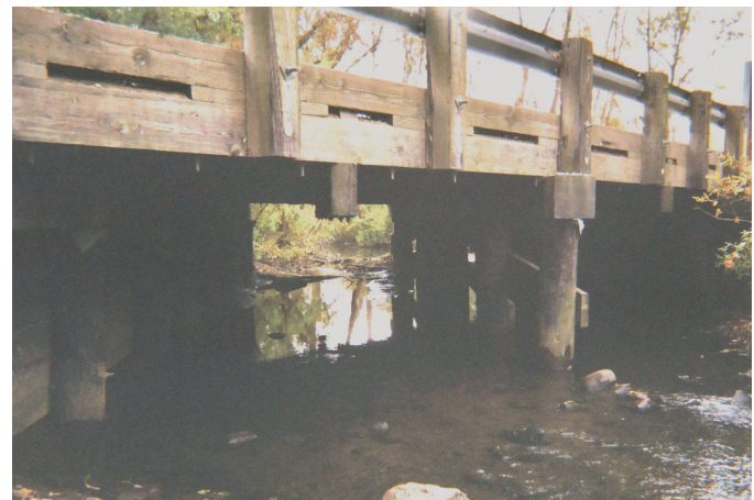
Figure 3. Bridge at site 4, Honey Creek at Pratt Rd near Ann Arbor, Mich., on September 10, 2003.

Because the treatment discharge was much larger than the streamflow at site 14, fluctuations in this discharge could have masked any loss or gain in this reach. For this