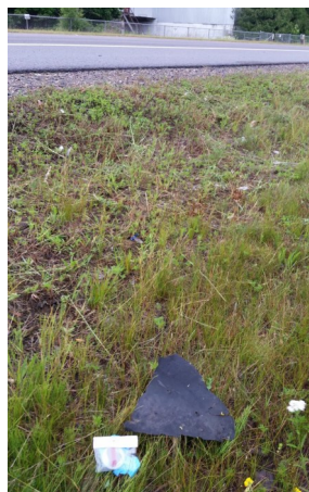
Asbestos roofing in M-26 ROW.

The EPA evaluated the existing information, conducted a removal assessment, and is working with Honeywell Specialty Materials and the property owner to further evaluate risks and develop a remedial approach. The DEQ, EPA, MDHHS, WUPHD, the property owner, Houghton County, and Torch Lake Township officials worked together to find a solution to the C&H Mineral Building property roof. The property owners have indicated their intention to remove the roofing material from the Mineral Building in the upcoming weeks.