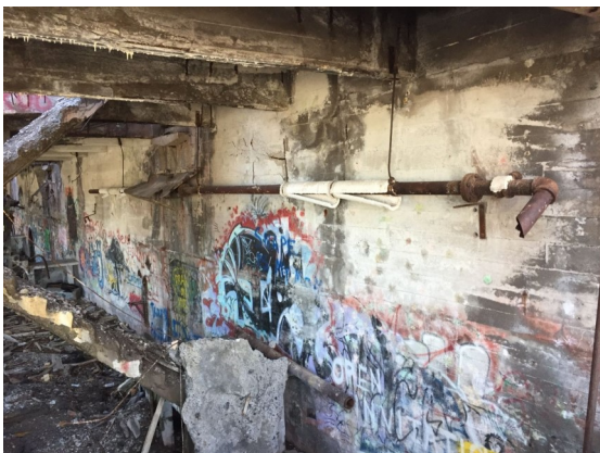
These photos are of the Quincy Stampmill No. 1 ruins in Mason

The DEQ and EPA have notified the property owners and representatives of the MDHHS, WUPHD, and Osceola Township of the study area conditions. The EPA is in the process of evaluating existing information and planning a potential removal action during 2018.