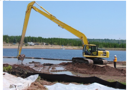
Excavator removing near-shore reclamation plant wastes during an emergency removal in Lake Linden in 2007.