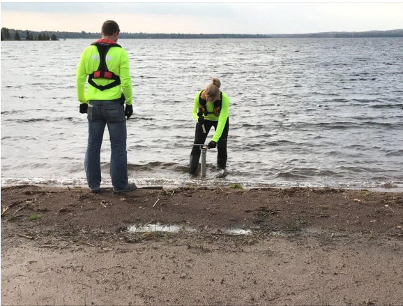
Near-shore sediment sampling in 2017.

Representatives of the EPA, DEQ, MDHHS, WUPHD, and Village of Lake Linden are working together to identify and implement measures to ensure the safety of the recreational area users.