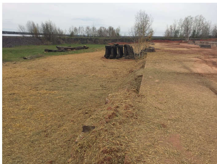
Calumet Stampmill foundation after asbestos removal completed and the area seeded and mulched.