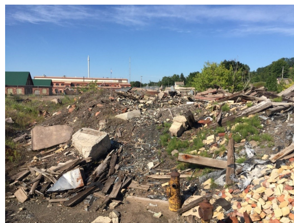
Debris piles at the Mineral Building property.