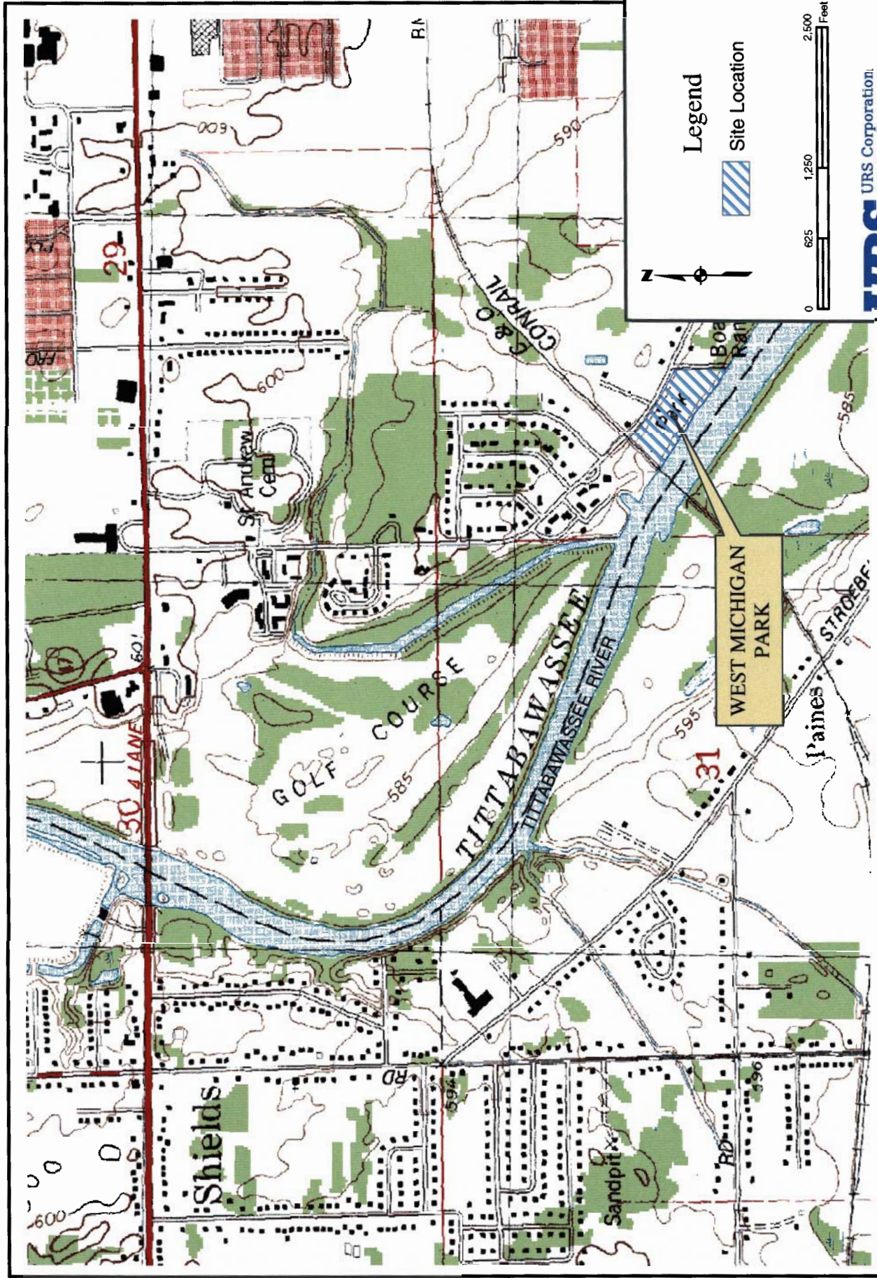
FIGURE 1 LOCATION OF WEST MICHIGAN PARK

URS URS Corporation 1701 Golf Road, Suite 1000 Rolling Meadows, IL 60008