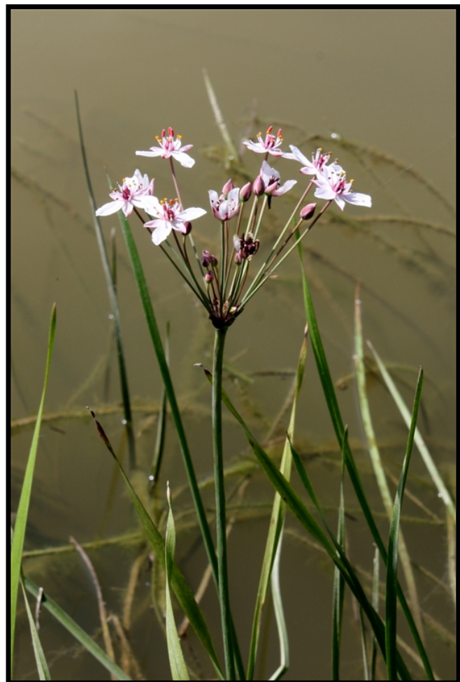
Figure 1. Flowering umbel of flowering rush ( Butomus umbellatus ).

Flowering rush is an emergent aquatic perennial plant with linear, sword-like leaves, triangular in cross-section, and a showy umbel of pink flowers (Figure 1). Rhizomes (i.e. horizontal root-like stems) are fleshy, and leaves have parallel veination and can be submersed or emergent. Submersed leaves are linear and limp, unlike sword-like emergent leaves. Flowering rush blooms from June to August. Flowers are arranged in terminal umbels. Flower parts are found in multiples of three (e.g. six tepals, nine stamen, six carpels) with pink to purple tepals 0.25 – 0.5 in (6 - 11.5 mm) long (eFloras 2008). Each flower produces up to six beaked fruits. Flowering rush also produces bulbils (i.e. small bulb-like structure that may produce a new