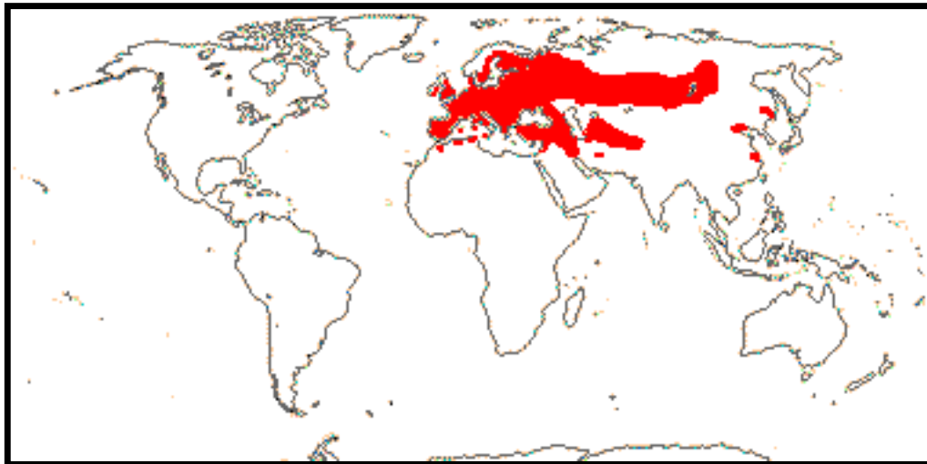
Figure 3. The native range of flowering rush ( Butomus umbelatus ) in Eurasia. Map from Hultén and Fries (1986)

Flowering rush grows best in shallow, slow moving ditches, streams, rivers, and lakeshores in temperate regions. It can grow in water up to 10 ft (3 m) deep as emergent plants and submersed plants may grow as deep as 20 ft (6.1 m) in clear waters (Jacobs et al. 2011). European specimens grew in stable or fluctuating water levels, but were outcompeted by other plants when water levels were stable (Hroudová et al. 1996). Some studies have found that FR does not grow well in high nutrient conditions (Hroudová and Zákřavský 1993a; Trebitz and Taylor 2007).