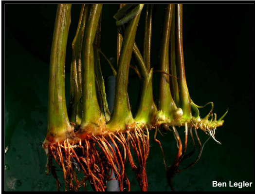
Figure 2. Rhizomes and rhizome bulbils of flowering rush ( Butomus umbellatus ).

Flowering rush reproduces both asexually and sexually, but in the North American populations, asexual reproduction is the primary method of distribution (Eckert et al. 2003; Klüber and Eckert 2005). Asexually, FR expands colonies via rhizome fragmentation, and bulbils produced at the base of the flowers and on rhizomes (Figure 2). Each bulbil may grow into a clone of the parent plant.