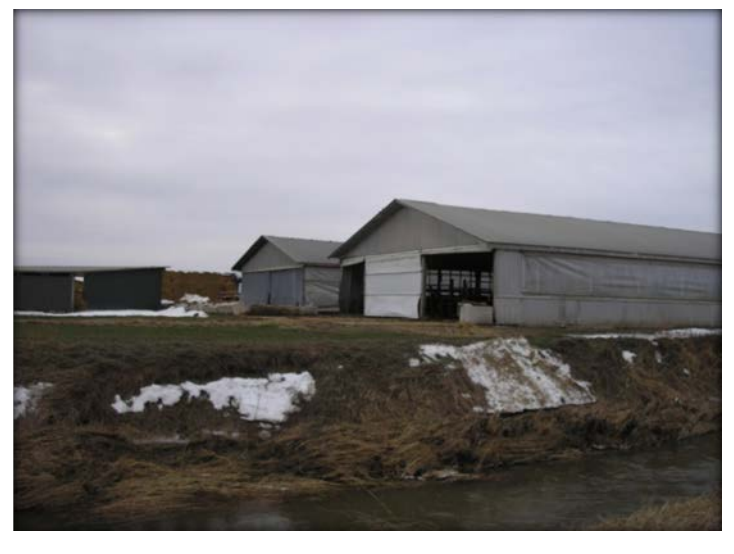
Potential source and cause for E.coli contamination