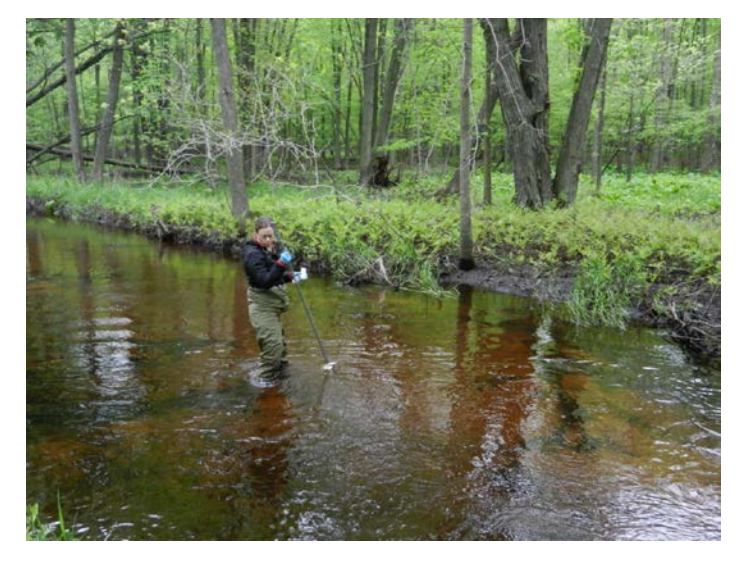
E. coli sampling