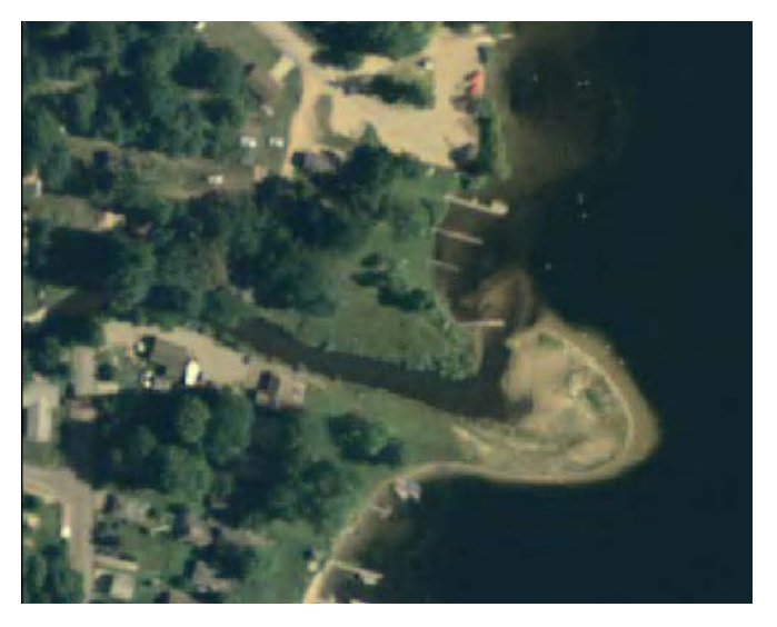
Sediment load into Lincoln Lake