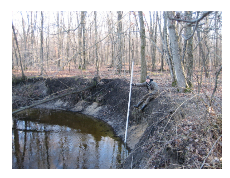
Bank erosion in Black Creek