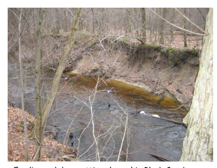
Eroding and downcutting channel in Black Creek