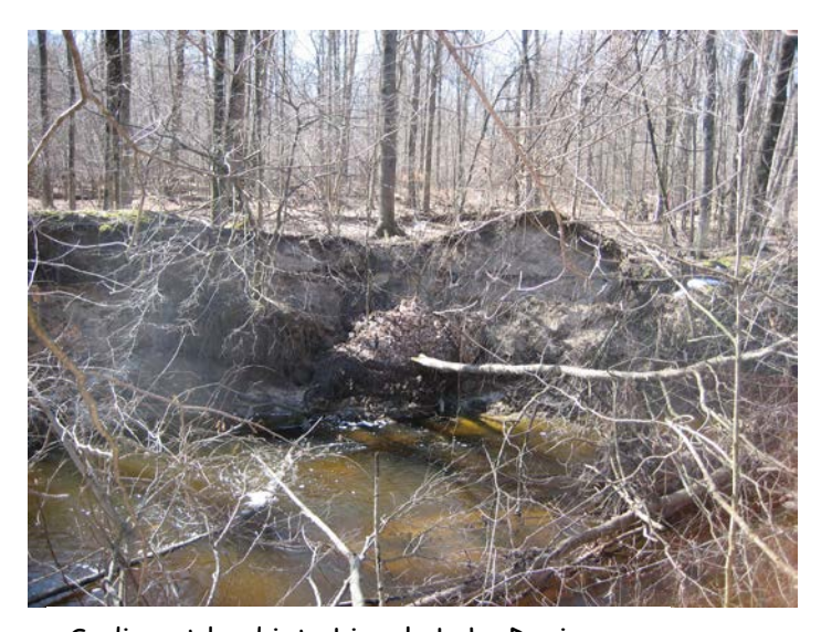
Sediment load into Lincoln Lake Drain