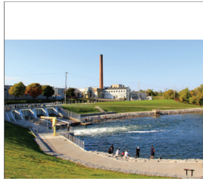
Cheboygan County Local Ordinance Gaps Analysis An essential guide for water protection

Grant Amount: $155,700 Match Funds: $ 94,600 Total Amount: $ 250,300